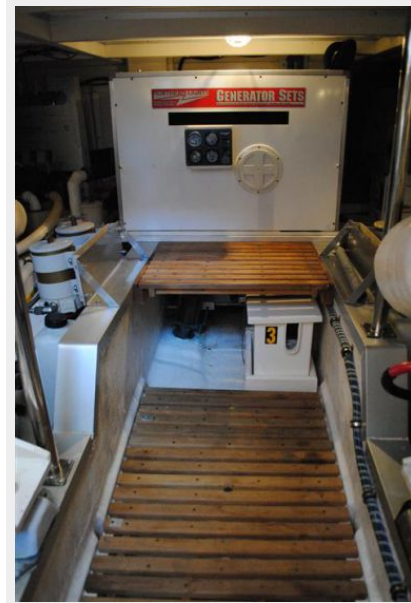
Engine Room Looking Aft