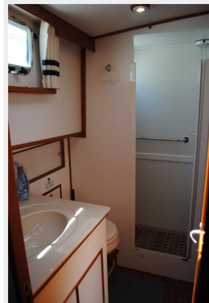
Head Looking Aft