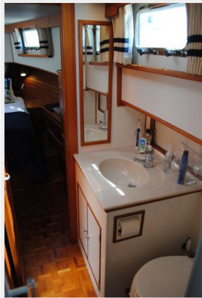
Head Looking Aft