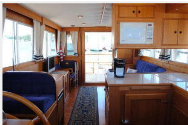
Galley and Salon Looking Aft