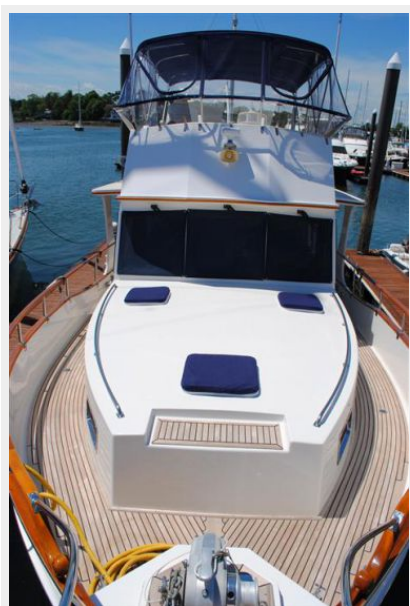
Bow Looking Aft