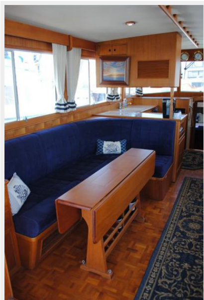
Salon to Port