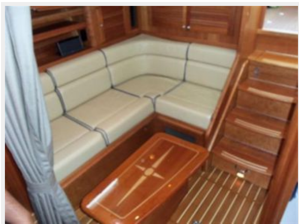
Companionway to deck