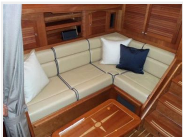
Salon L-shaped sofa & coffee Table