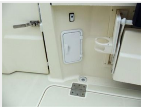
Cockpit Hot & Cold Shower