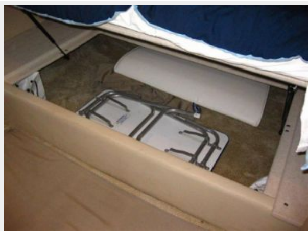
Guest Stateroom Storage