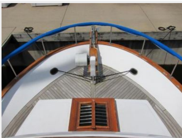
Bow from Flybridge