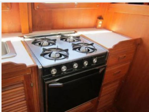
Galley stove -Propane