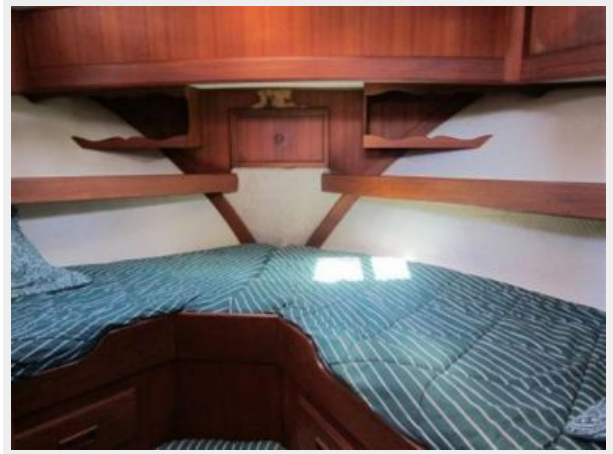
Forward Stateroom Vee berth