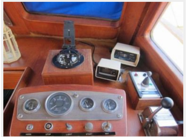
Lower Helm 2