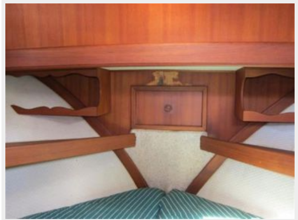
Forward Stateroom chain locker access