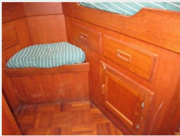
Forward Stateroom storage below berth