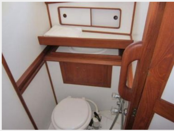
Forward Head 2