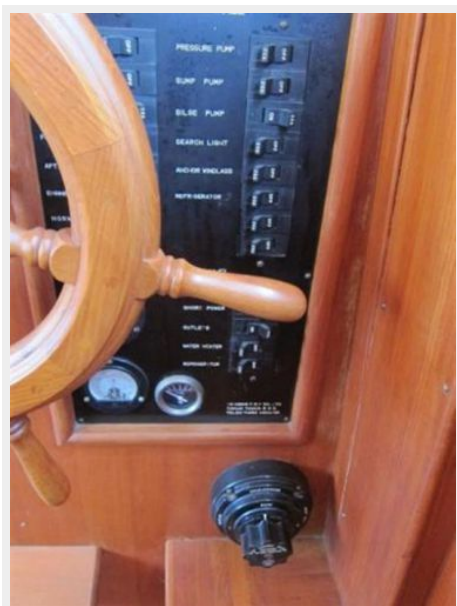
Lower Helm 3