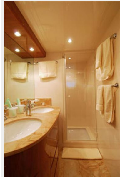
VIP Aft Guest Head