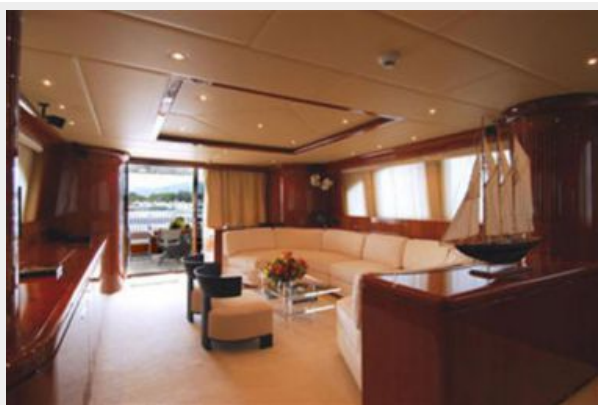
Salon looking aft