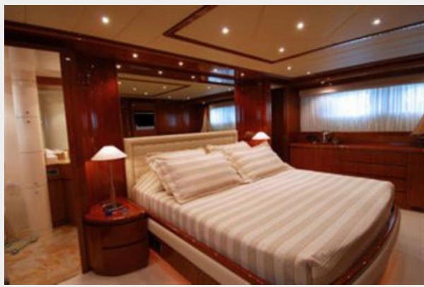
VIP Aft Guest Stateroom