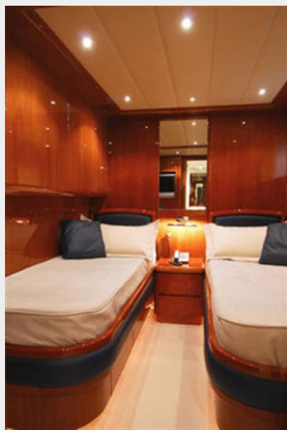
Port Twin Guest Stateroom