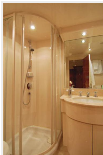
VIP Forward Guest Head