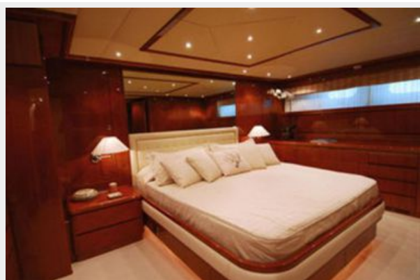
VIP Forward Guest Stateroom