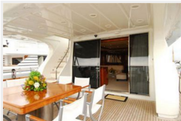
Aft Deck looking forward