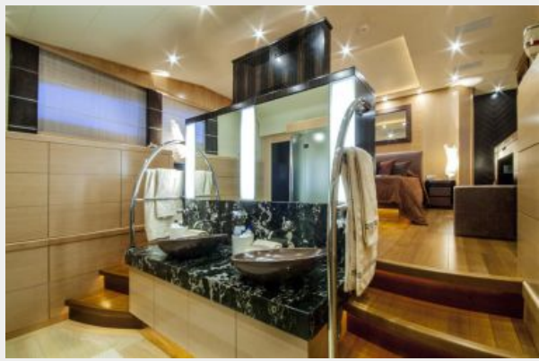
Master Cabin Bathroom