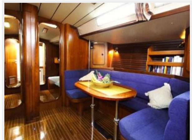
Beneteau First 51S - Saloon