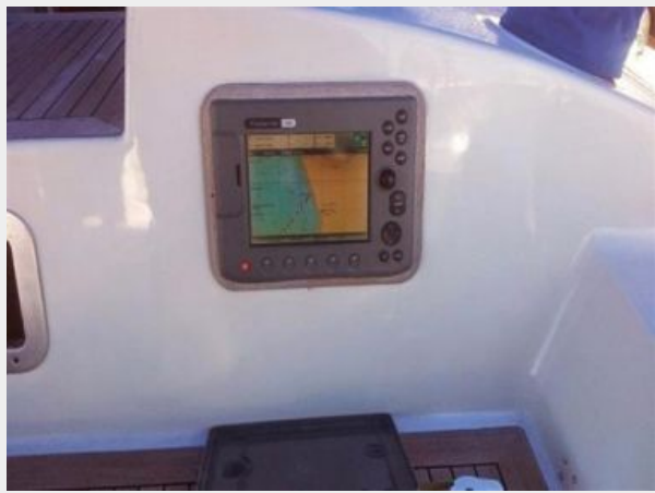
Beneteau First 51S - Electronic