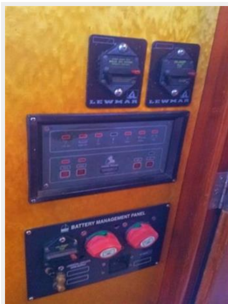
Beneteau First 51S - Electronic