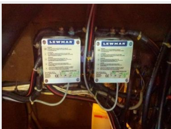
Beneteau First 51S - wiring