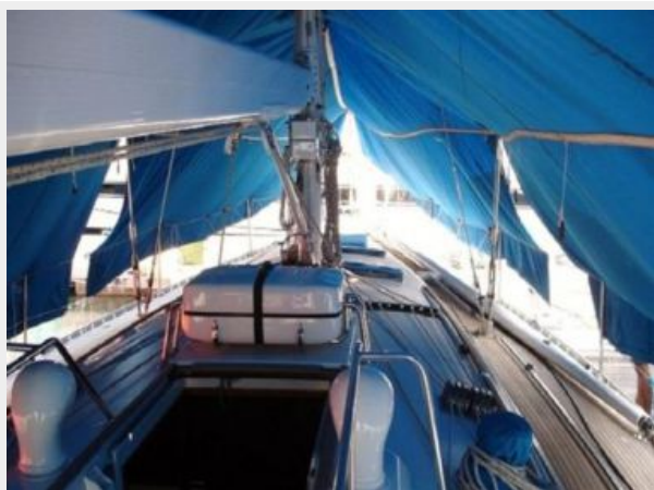
Beneteau First 51S - deck with awning