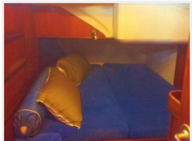
Beneteau First 51S - Cabin