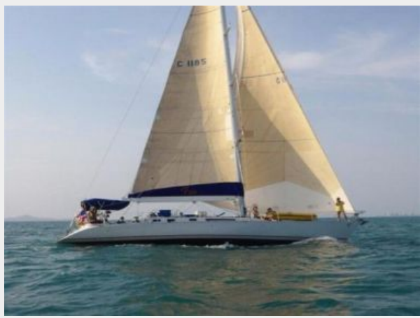
Beneteau First 51S - Profile