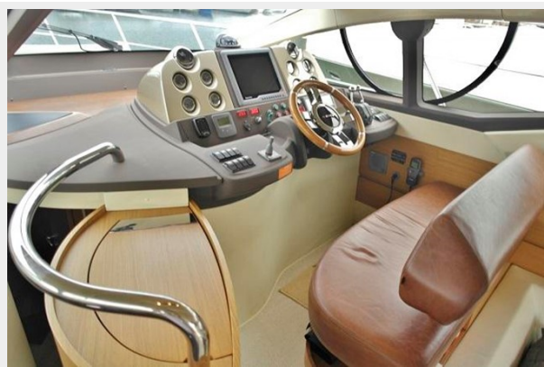
Azimut 43 Flybridge - Helm