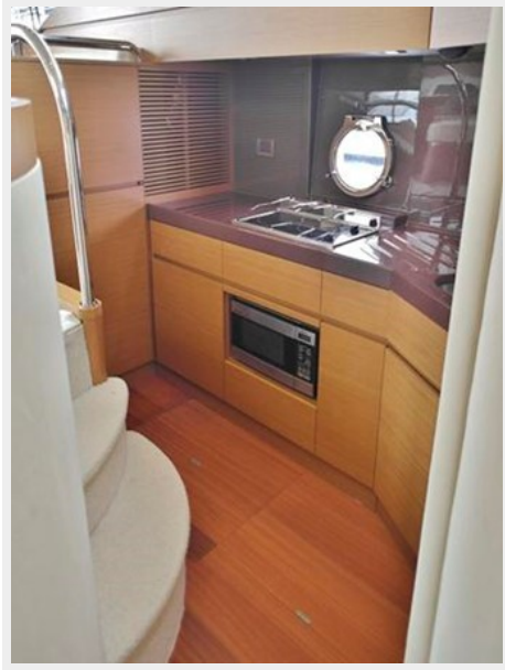
Azimut 43 Flybridge - galley