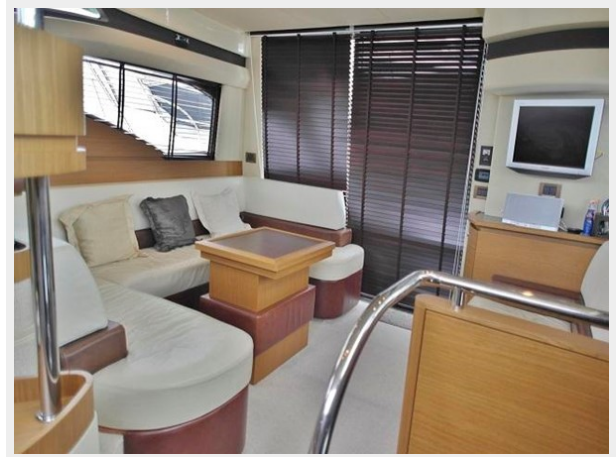
Azimut 43 Flybridge - Saloon