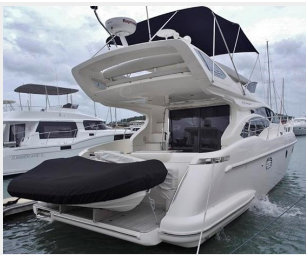
Azimut 43 Flybridge - Stern Profile