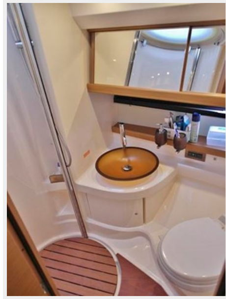
Azimut 43 Flybridge - head