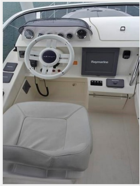
Azimut 43 Flybridge - Flybridge helm