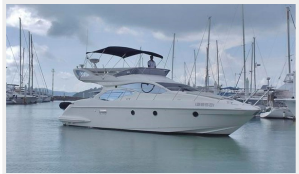
Azimut 43 Flybridge - Profile