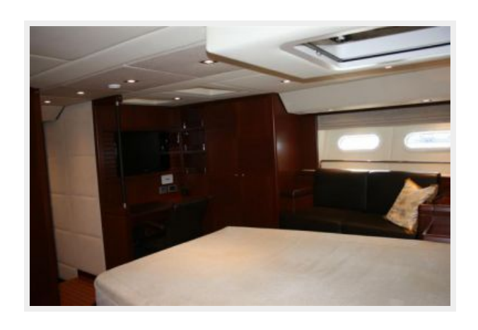
Owner's Stateroom Stbd