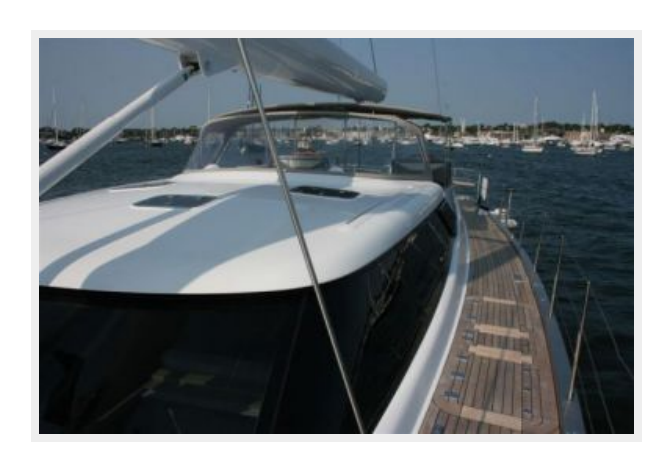
Side Deck Aft