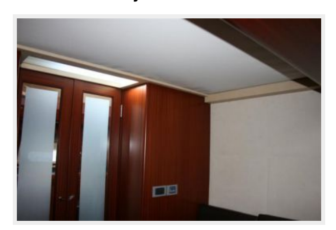
Library as Stateroom