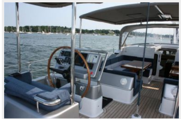
Port Helm Station