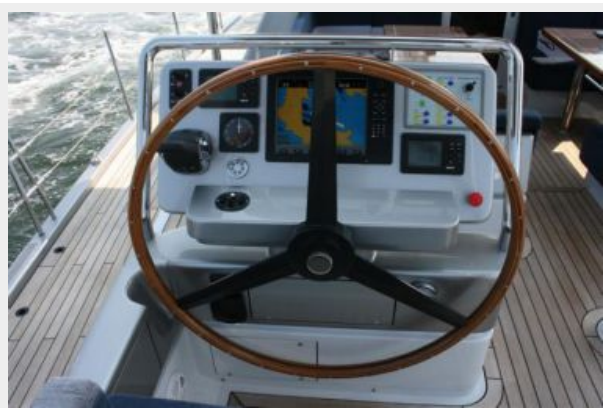
Helm Station Controls