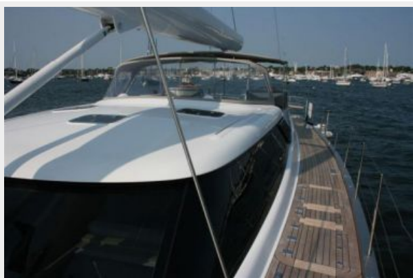
Side Deck Aft