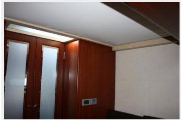
Library as Stateroom