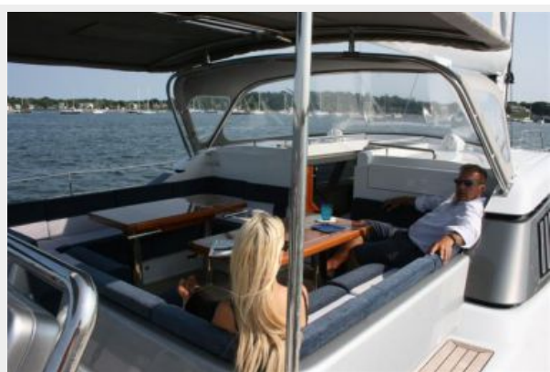
Guest Cockpit Forward