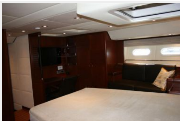
Owner's Stateroom Stbd