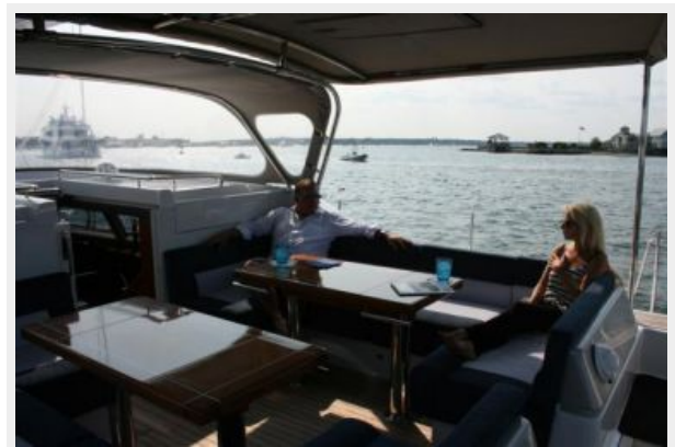
Guest Cockpit Starboard