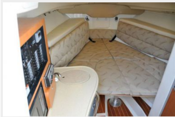
Walk Around Cuddy