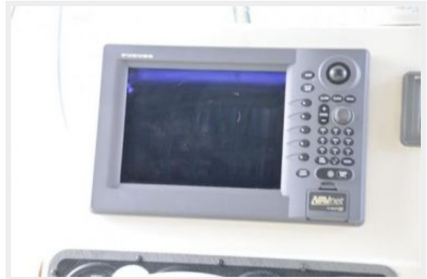
Electronics Detail 1