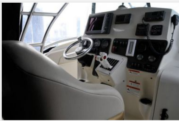
Angled Profile of Helm