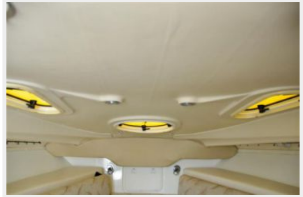
Ventilation and Egress