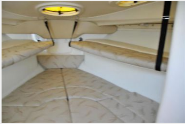
Starboard Side Bunk