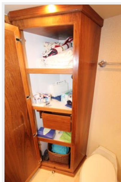
Master Stateroom Hanging Locker