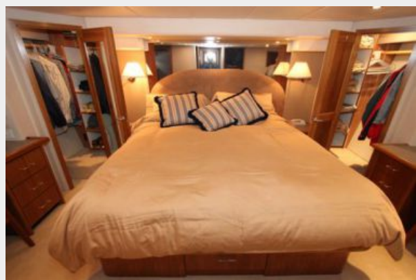
Master Stateroom Hanging Lockers