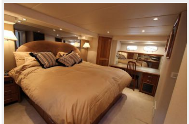
Master Stateroom Hanging Locker