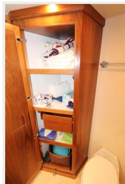
Master Stateroom Hanging Locker