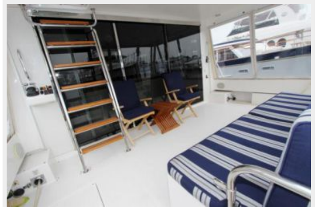
Aft Deck and Third Station