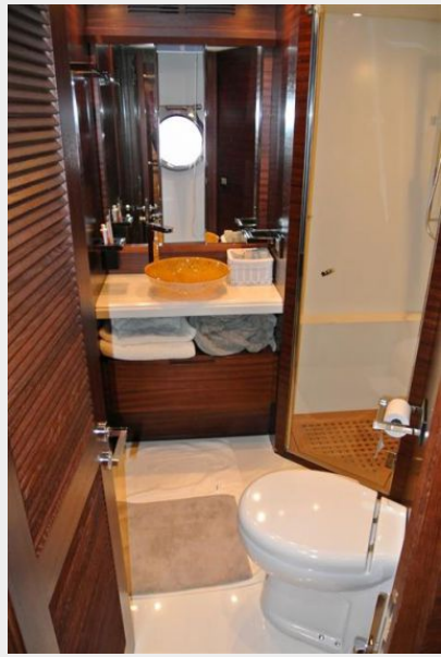
Shared Day Head