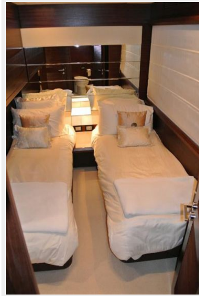
Guest Cabin 1