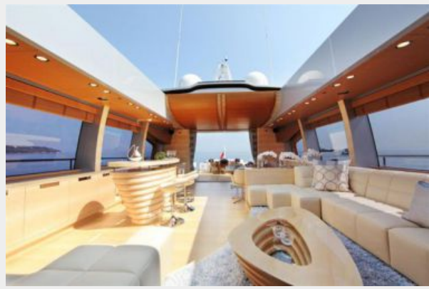
Saloon Looking Aft with Open Roof