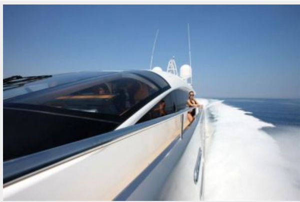
Port Side View Moving