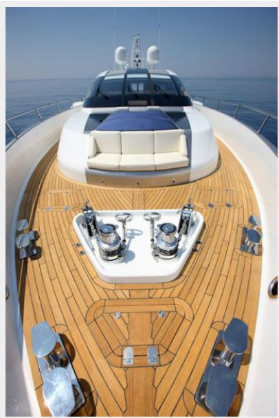
Bow View 1