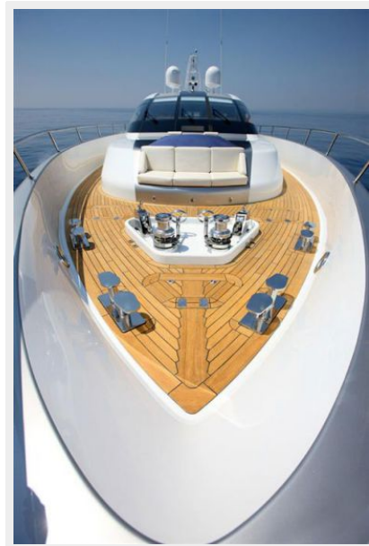
Bow View 2