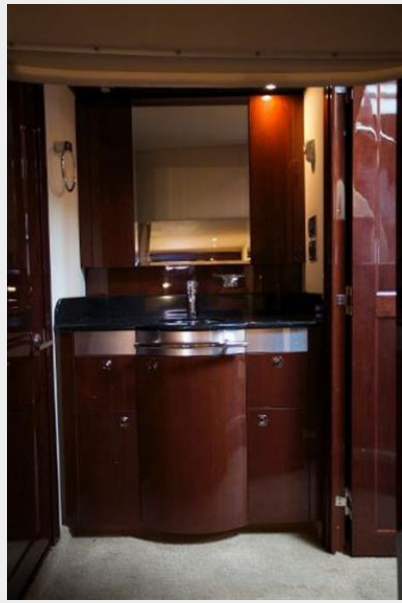
Aft Stateroom sink