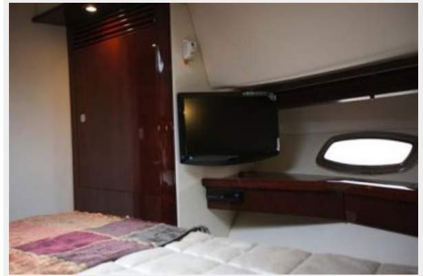
Forward Master Stateroom