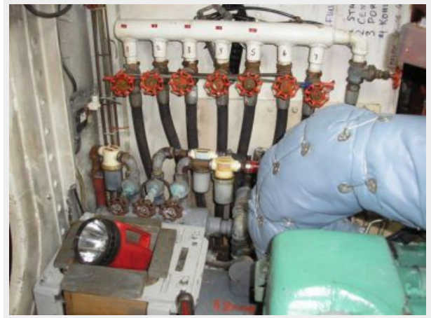
Engine Room 3