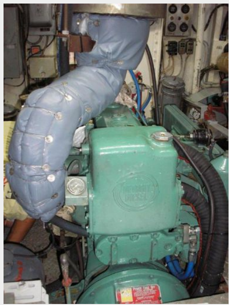
Engine Room 4