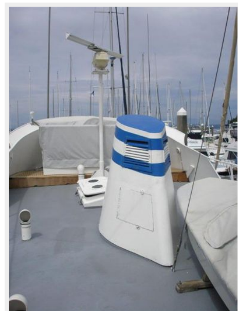
Upper Deck View Forward