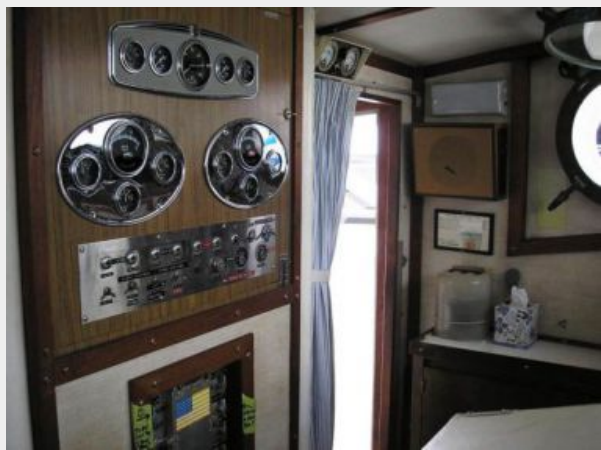
Aft Bulkhead Pilothouse