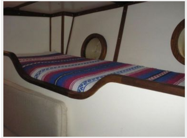
Forward Upper Bunk