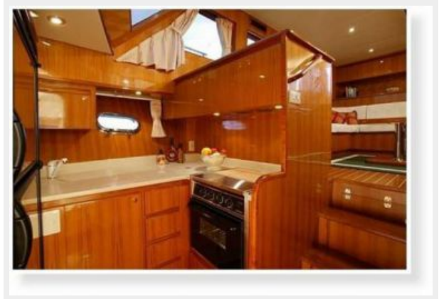
48' Novatec galley photo1