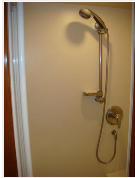
48' Novatec guest stateroom shower