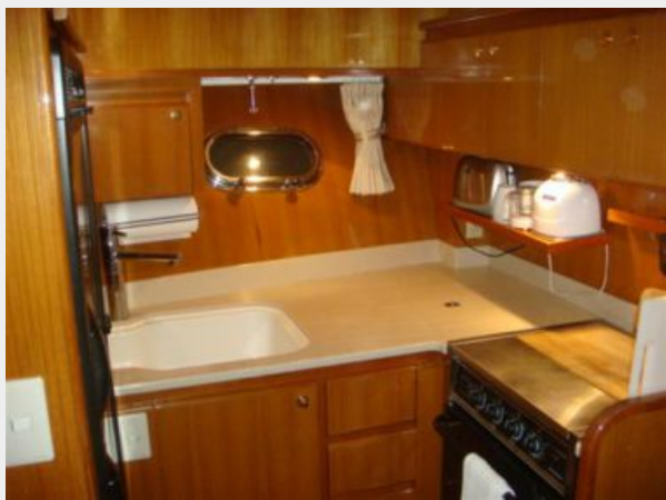
48' Novatec galley photo2