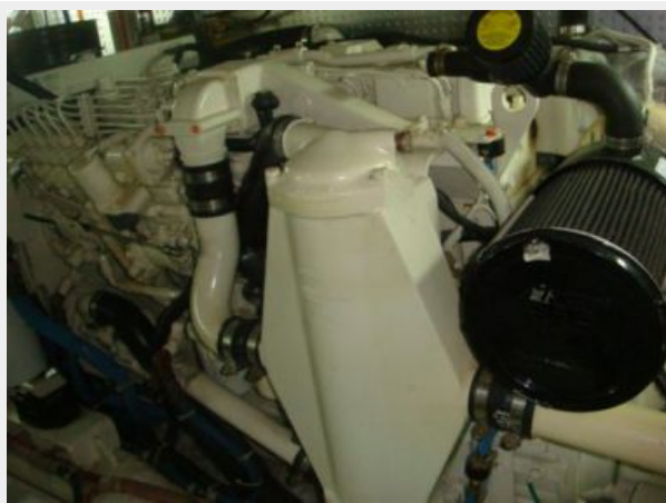
48' Novatec starboard main engine