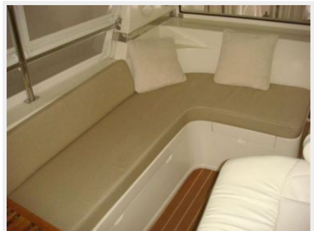
48' Novatec flybridge starboard seating