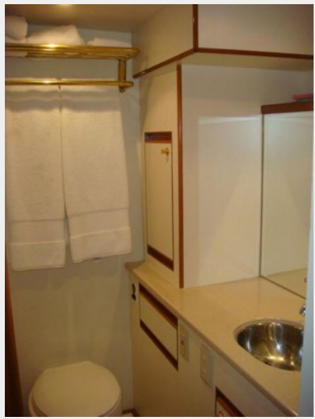
48' Novatec master stateroom head