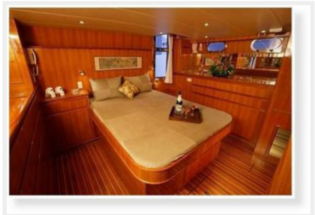
48' Novatec master stateroom