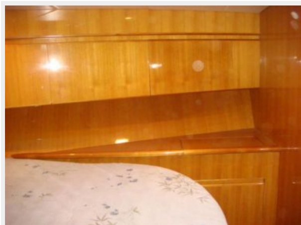
48' Novatec guest stateroom starboard