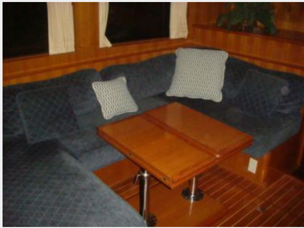
48' Novatec salon seating