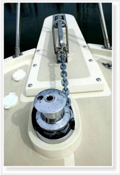
48' Novatec anchor windlass