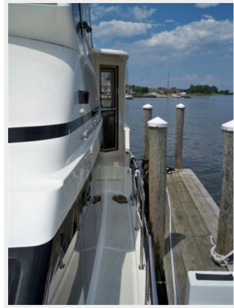
48' Novatec port side deck