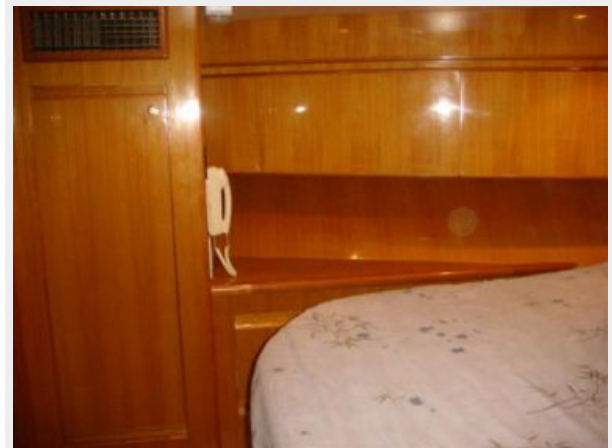
48' Novatec guest stateroom port