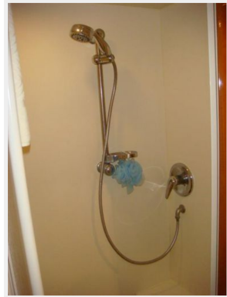
48' Novatec master stateroom shower