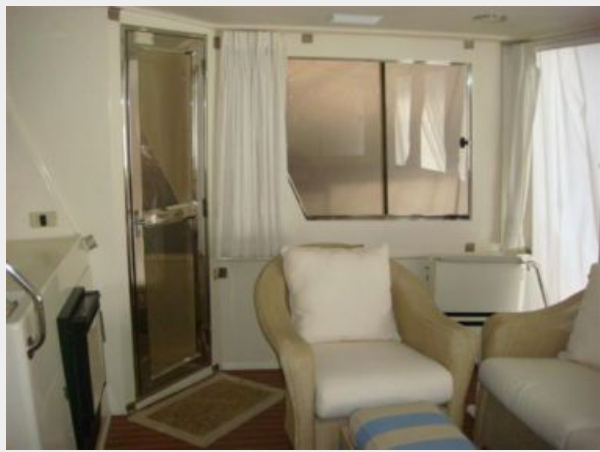
48' Novatec sundeck starboard