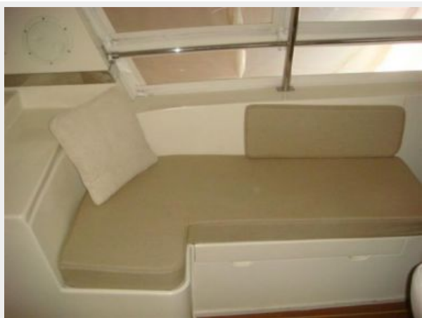
48' Novatec flybridge port seating