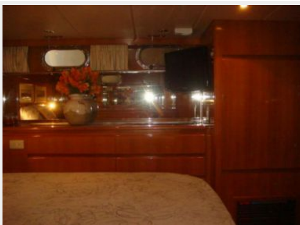
48' Novatec master stateroom port