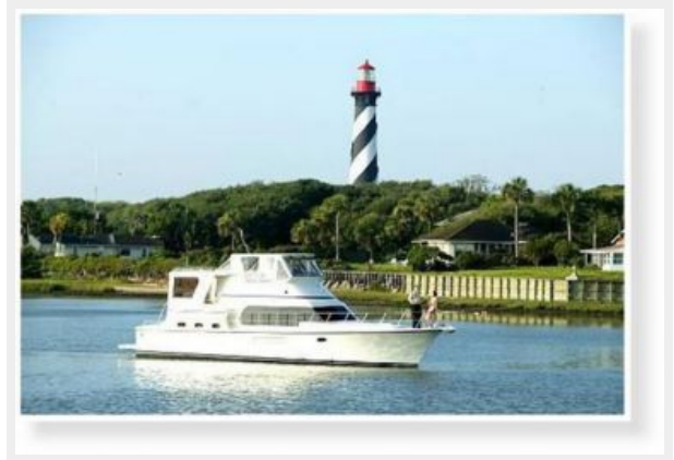
48' Novatec starboard profile