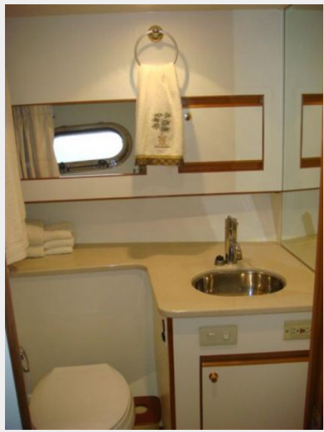
48' Novatec guest stateroom head