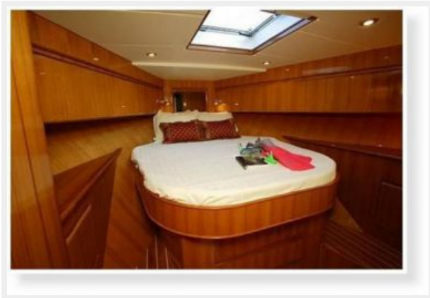
48' Novatec guest stateroom