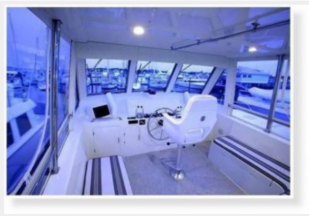
48' Novatec flybridge forward