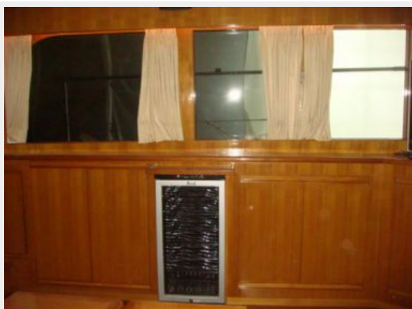
48' Novatec salon port