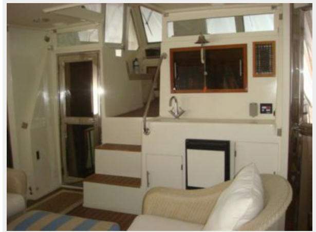
48' Novatec sundeck forward