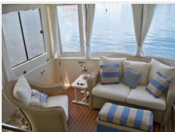
48' Novatec sundeck