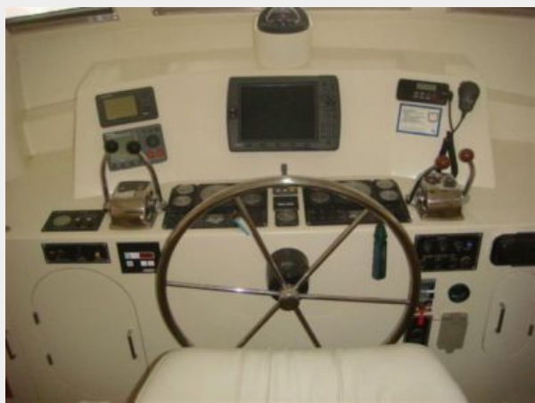
48' Novatec flybridge helm