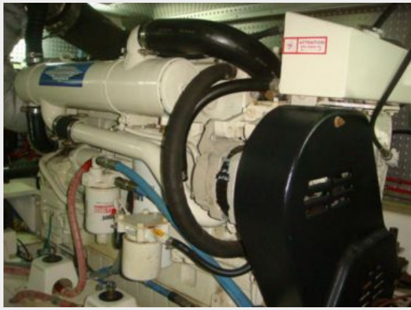
48' Novatec port main engine