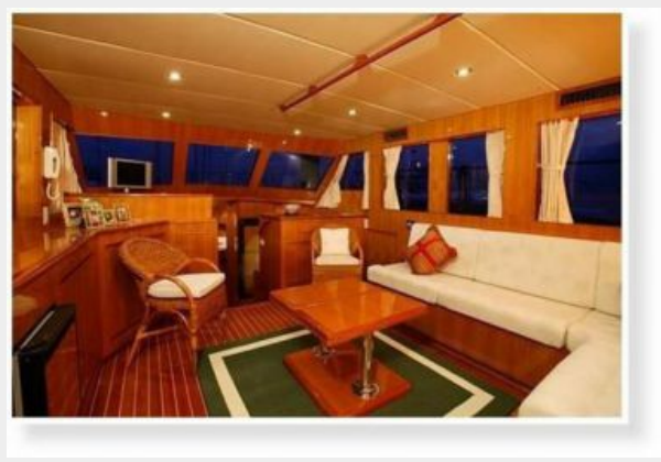
48' Novatec salon forward