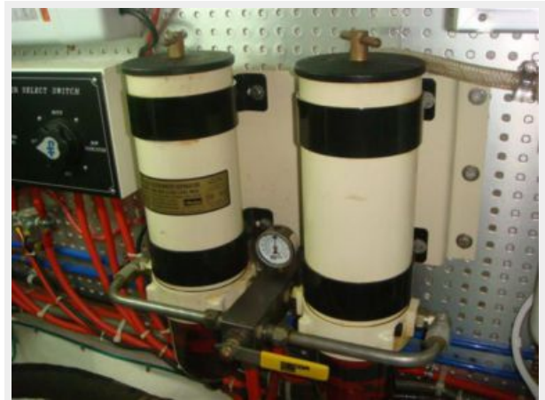
48' Novatec starboard Racor fuel filters