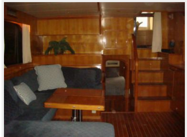
48' Novatec salon aft