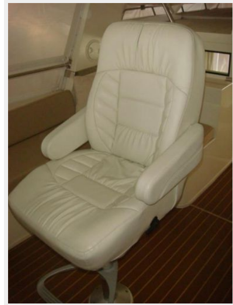
48' Novatec flybridge helmseat