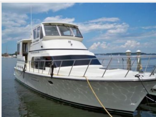
48' Novatec starboard forward profile