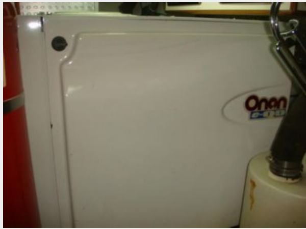
48' Novatec generator sound box