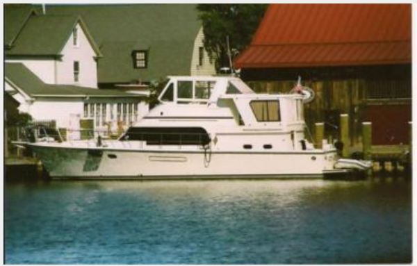
48' Novatec port profile photo2