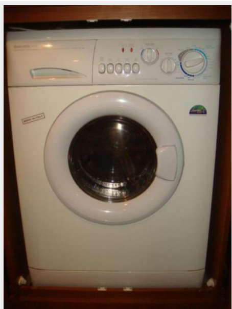
48' Novatec washer-dryer