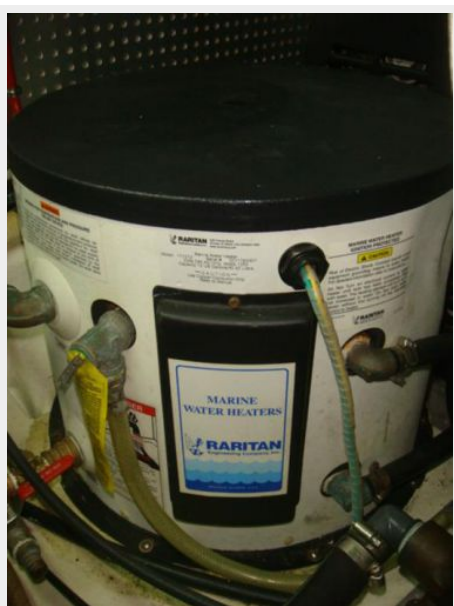
48' Novatec water heater