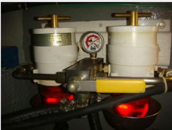
32' Levy Racor fuel filters