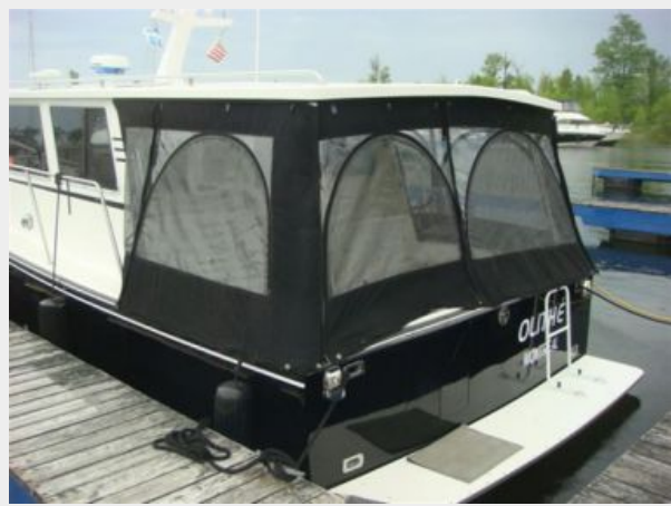
32' Levy aftdeck enclosure