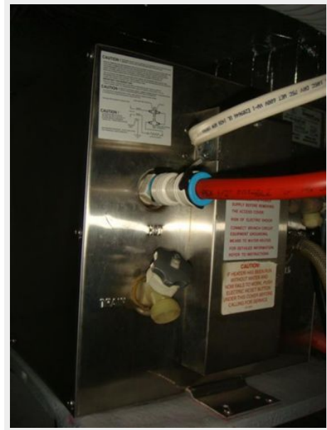
32' Levy water heater