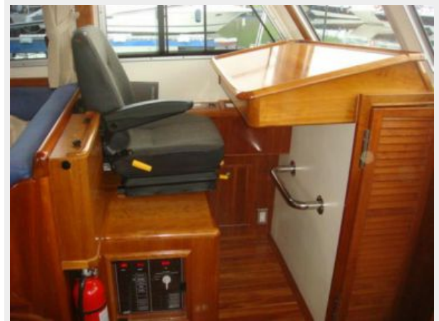
32' Levy helm port