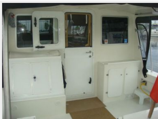
32' Levy aftdeck forward