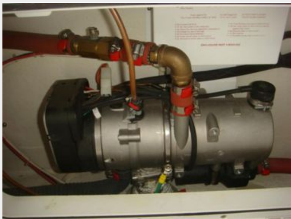
32' Levy heating system