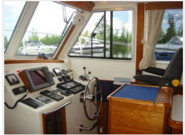
32' Levy helm photo1