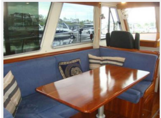
32' Levy salon seating photo1