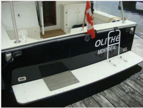
32' Levy swimplatform