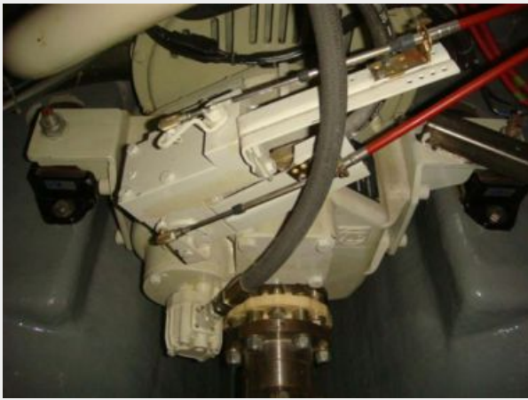
32' Levy gearbox