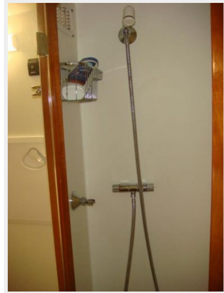
32' Levy master stateroom shower