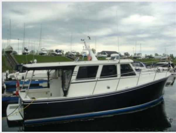
32' Levy starboard aft profile