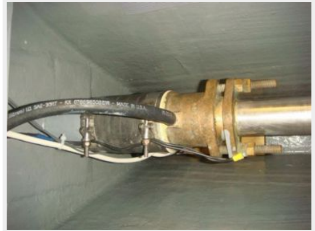
32' Levy shaft seal