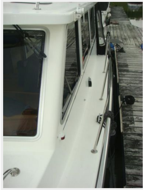
32' Levy port side deck