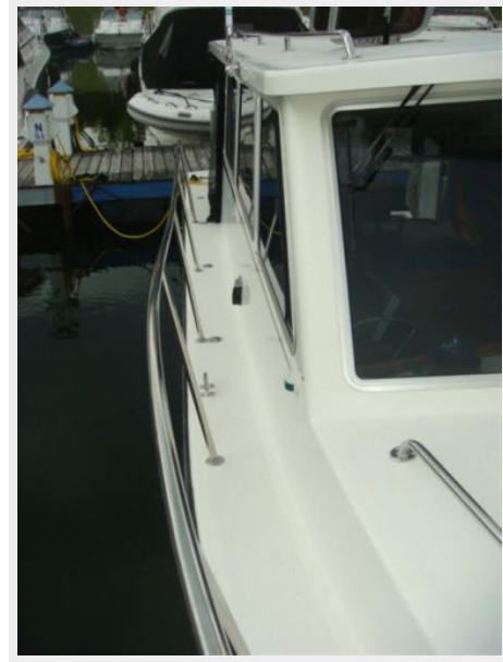
32' Levy starboard side deck