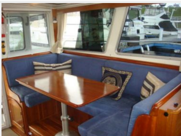
32' Levy salon seating photo2