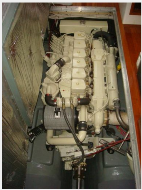
32' Levy engine compartment