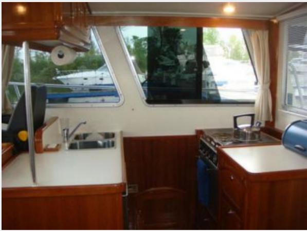
32' Levy galley photo2