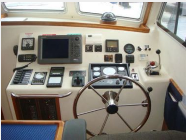
32' Levy helm photo2