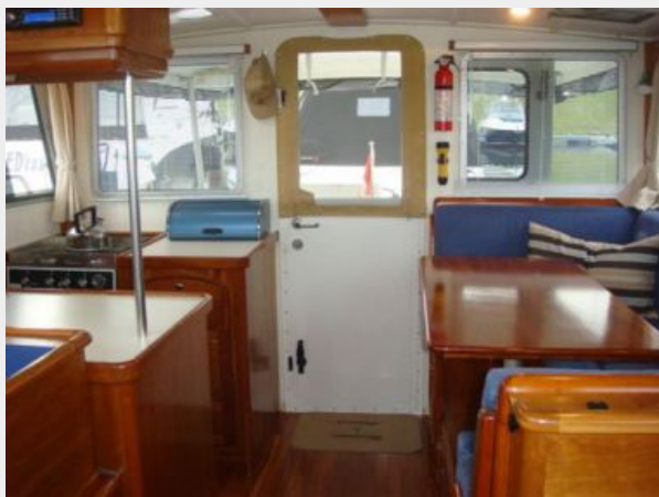
32' Levy salon aft