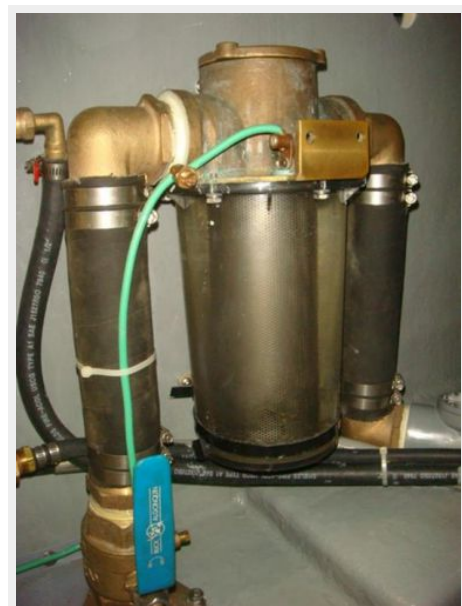
32' Levy sea strainer