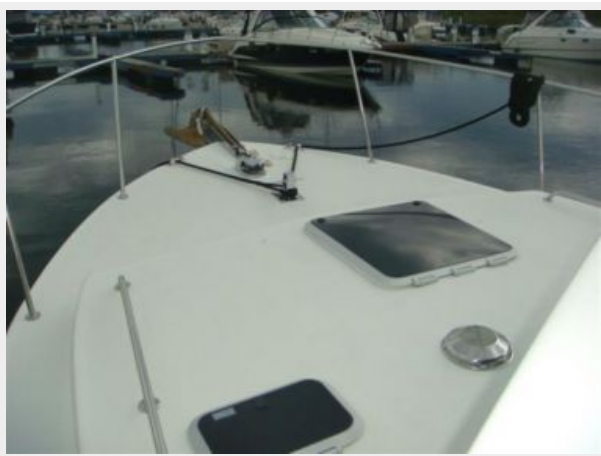
32' Levy foredeck