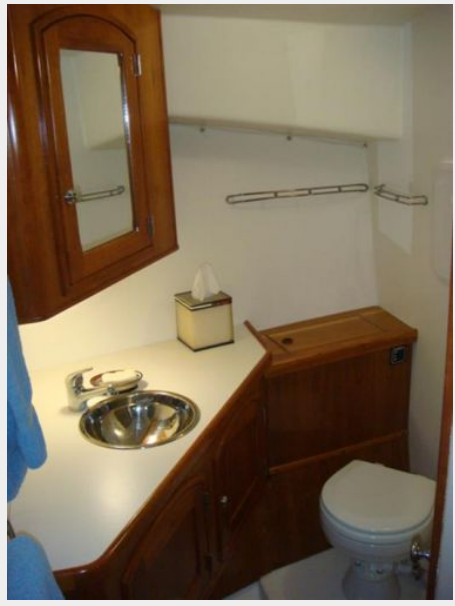
32' Levy master stateroom head