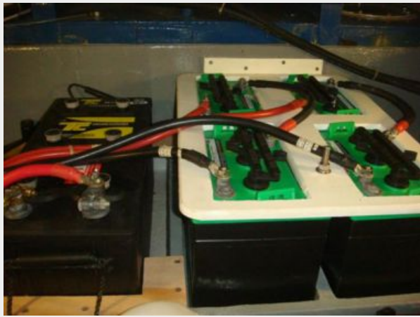
32' Levy battery bank