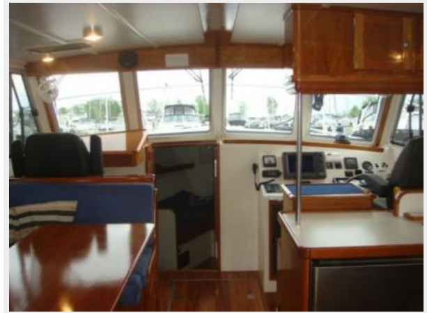
32' Levy salon forward