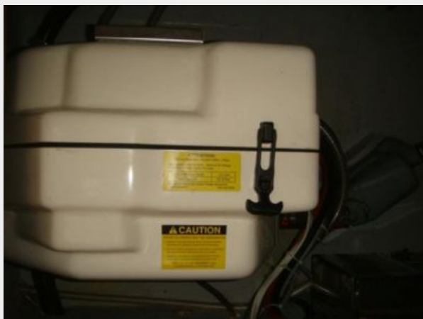
32' Levy generator sound box