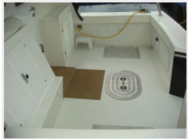
32' Levy aftdeck