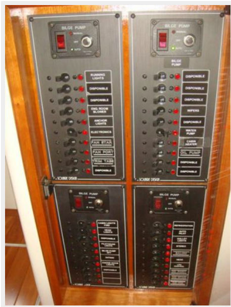
32' Levy electrical panel1