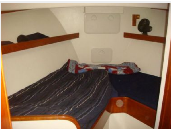
32' Levy master stateroom