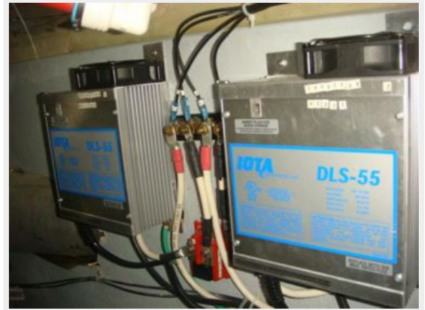
32' Levy battery chargers