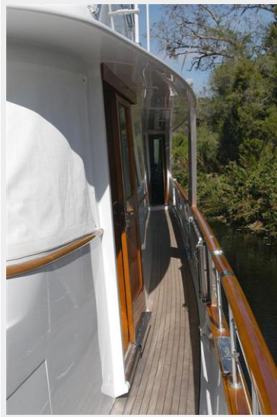
Deck Port Side