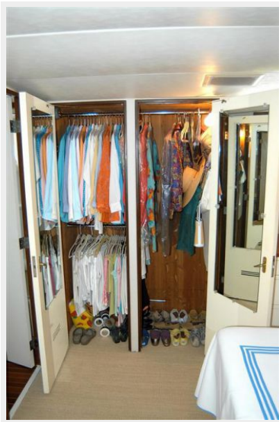
Master Her Closet