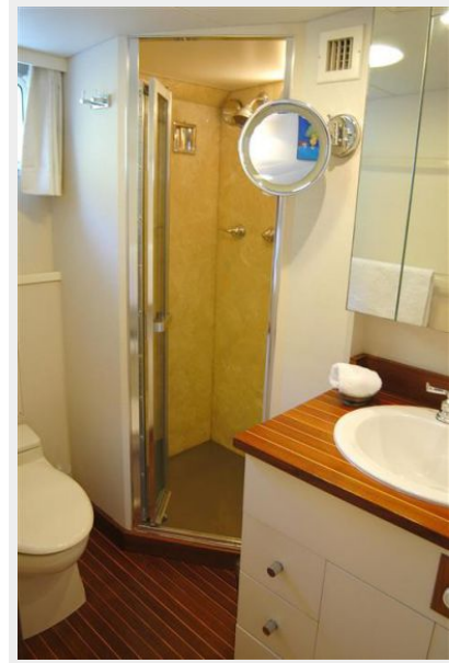
Master His Head