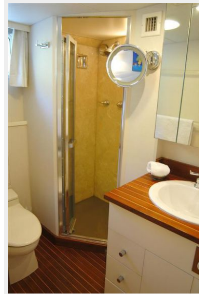
Master His Head