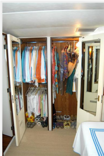
Master Her Closet