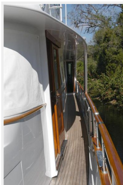
Deck Port Side