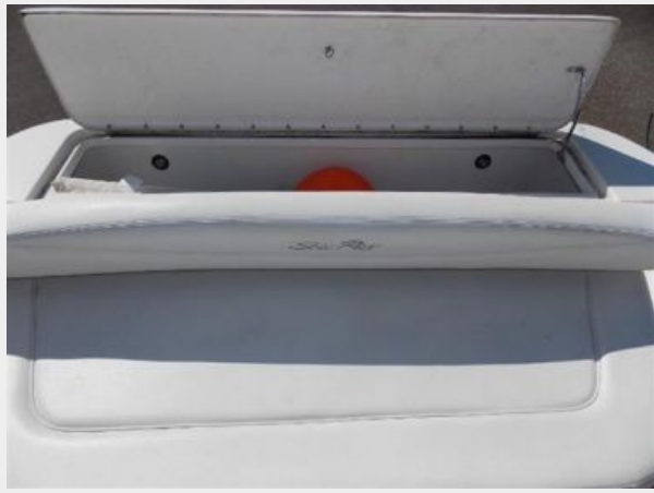
Large Fish Box