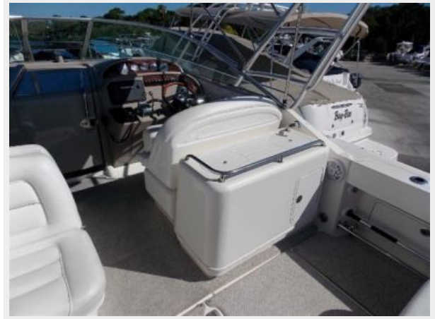
Baitwell and Prep Station