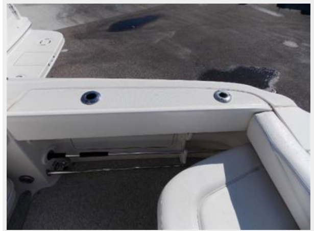
Factory Rod Holder