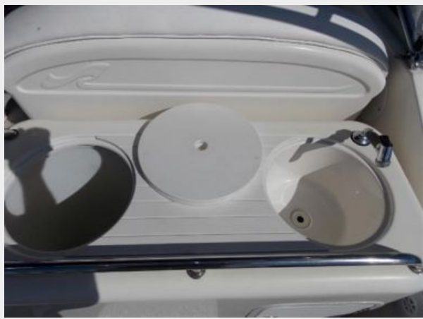
26 Gallon Livewell and Sink