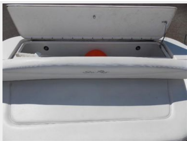
Large Fish Box