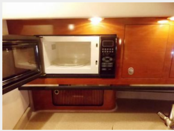
Like New Microwave