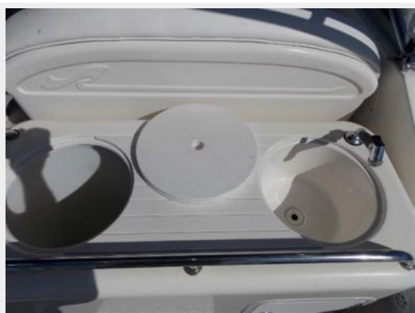
26 Gallon Livewell and Sink