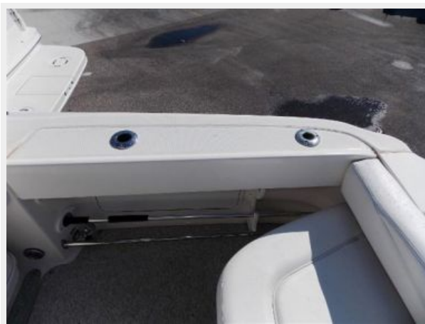
Factory Rod Holder