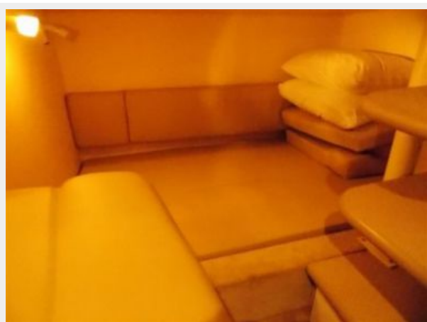
Mid Berth and Storage Area