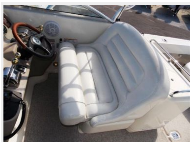
Double Helm Seating