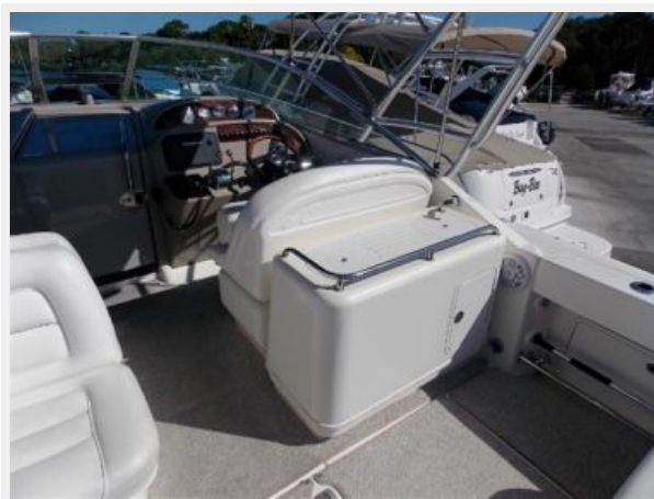
Baitwell and Prep Station