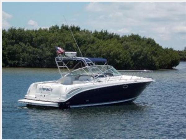
Starboard Stern Quarter