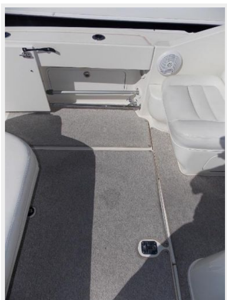
Like New Cockpit Carpet