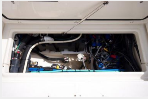
Bilge / Pumps / Batteries