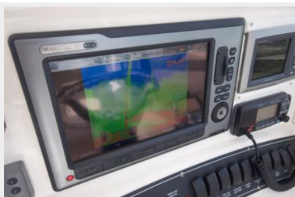
Electronics - FLIR