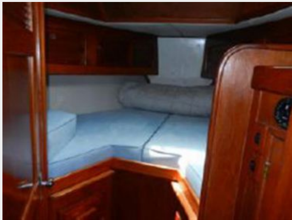
V berth with filler