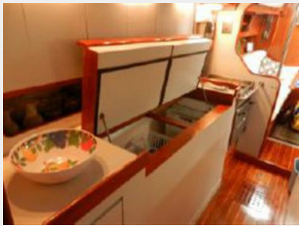
view from aft cabin