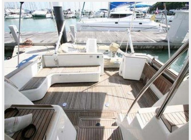
Beneteau Antares 45 - aft deck