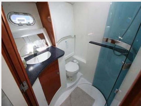
Beneteau Antares 45 - head