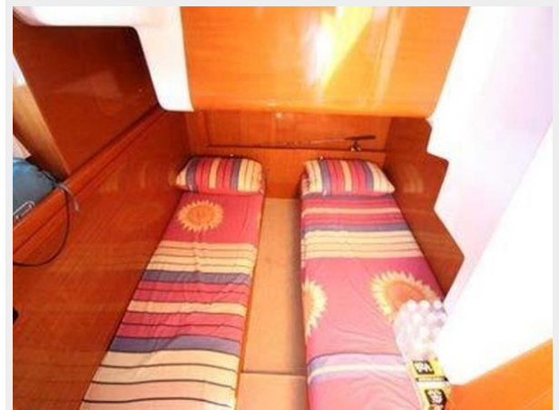
Beneteau Antares 45 - twin cabin