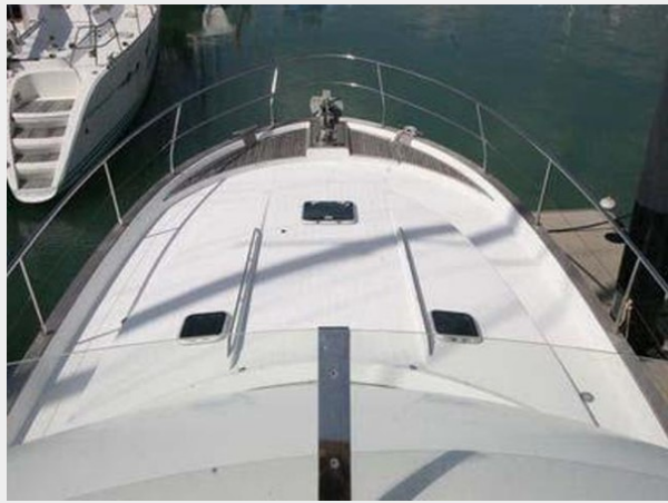
Beneteau Antares 45 - bow