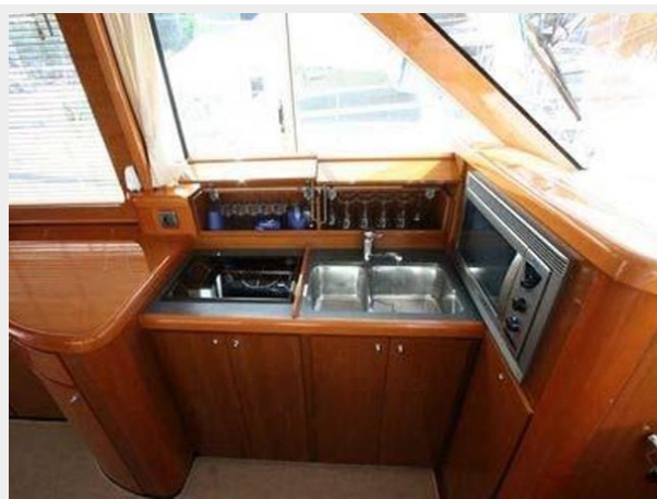
Beneteau Antares 45 - galley