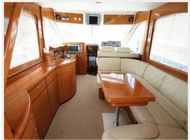
Beneteau Antares 45 - saloon