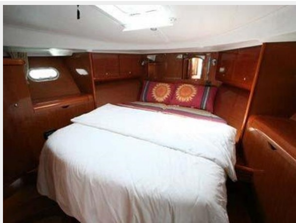
Beneteau Antares 45 - master cabin