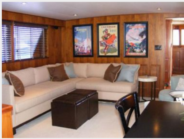
Salon looking forward