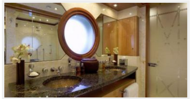
Entry to Lower Deck