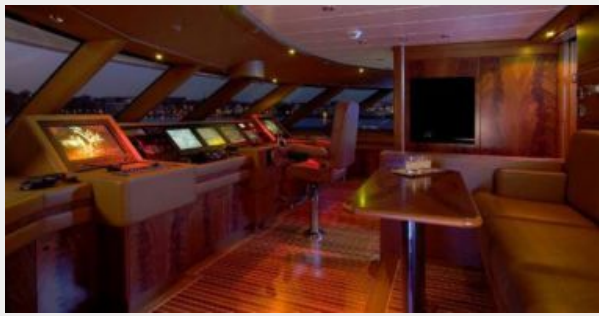
Entry to Skylounge