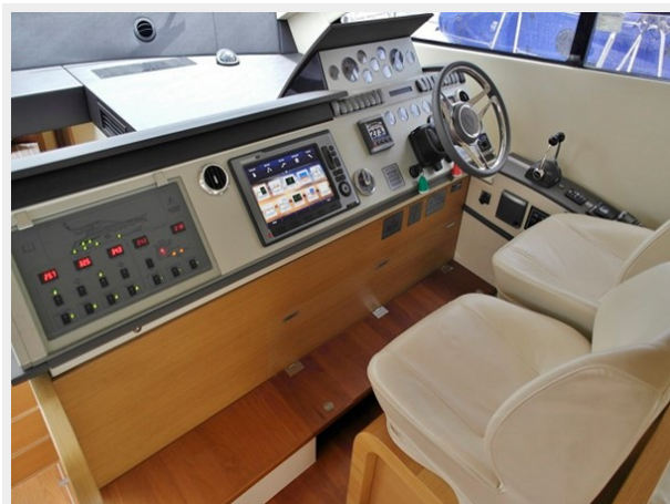
Fairline Phantom 48 - helm station