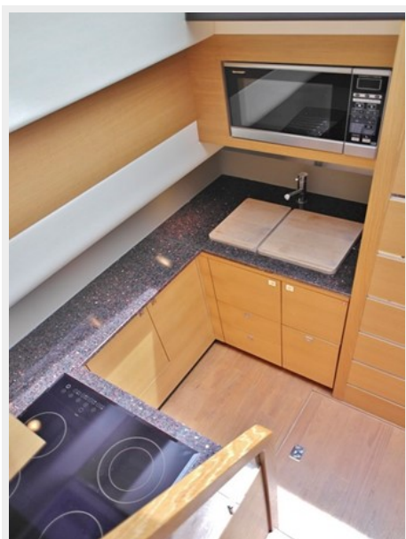
Fairline Phantom 48 - galley