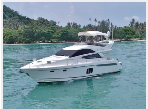
Fairline Phantom 48 - Profile