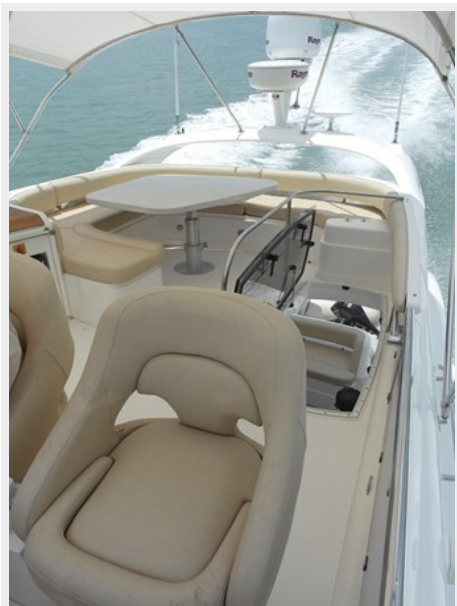
Fairline Phantom 48 - Flybridge