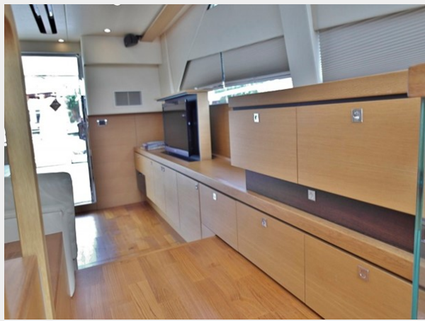
Fairline Phantom 48 - saloon