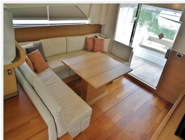
Fairline Phantom 48 - saloon