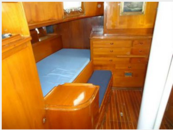
Starboard Berth Master Cabin