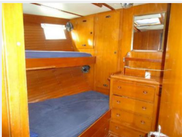
Port Guest Cabin