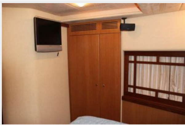
Stbd. Guest Stateroom