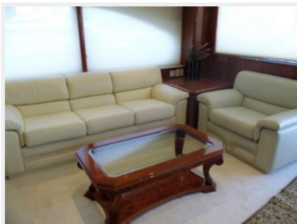
Sky Lounge Seating