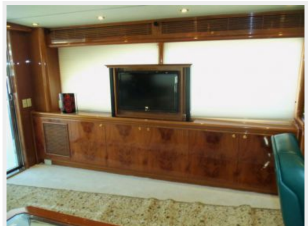
Sky Lounge TV