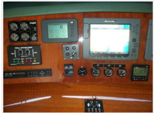
Helm Detail Port