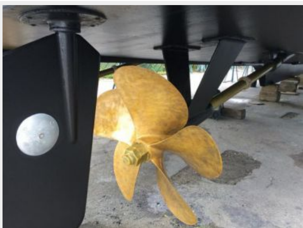
Oct 2014 Prop Speed