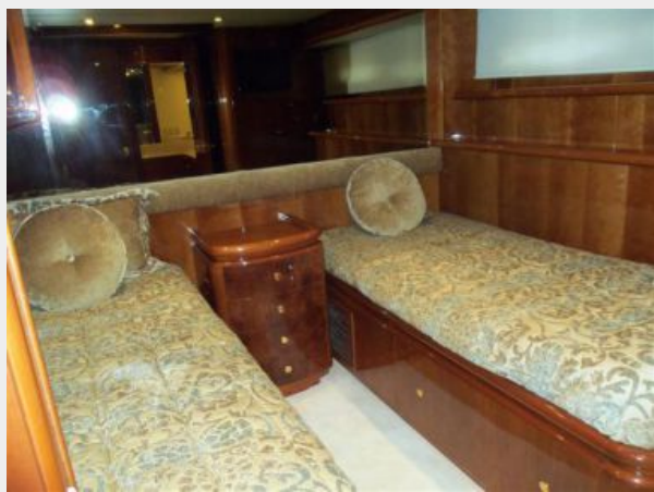
Port Guest Cabin Looking Aft