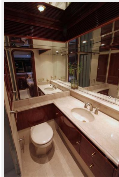
Starboard Guest Cabin Head