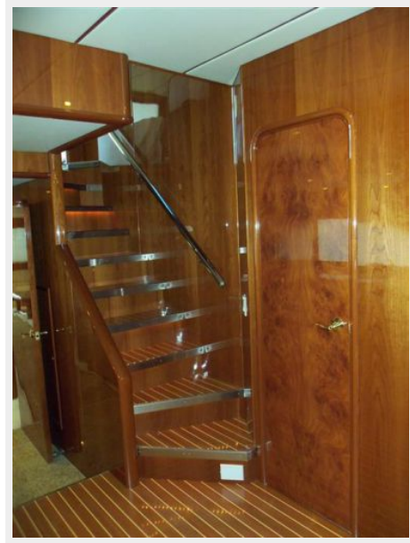
Sky Lounge Access Stairs