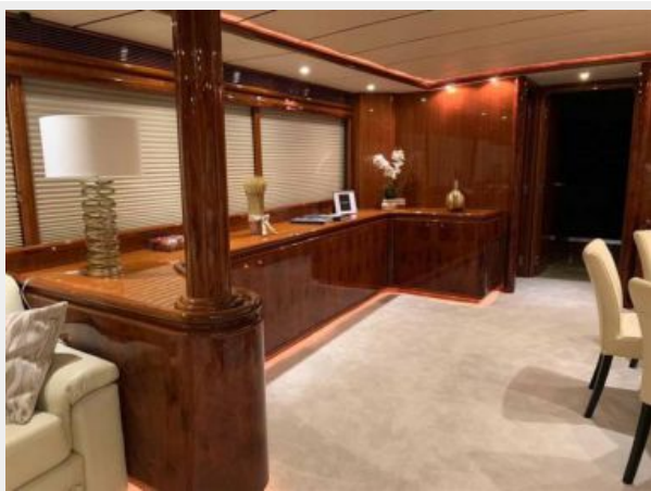
Dining to Port