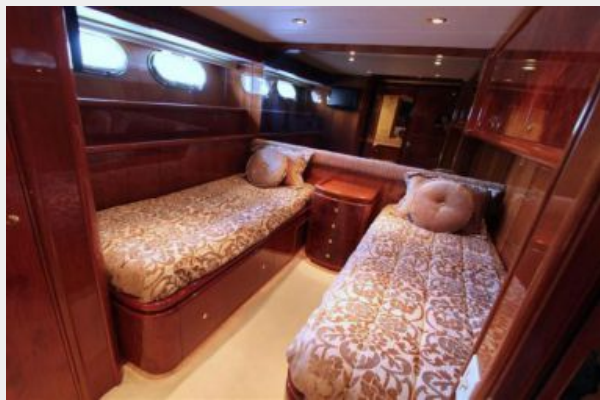
Starboard Guest Cabin