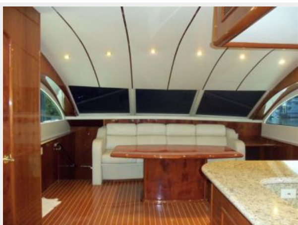
Country Kitchen Settee