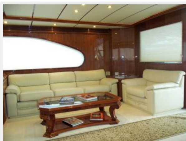
Salon to Starboard