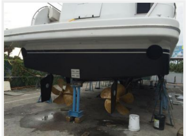
Oct 2014 Bottom Job