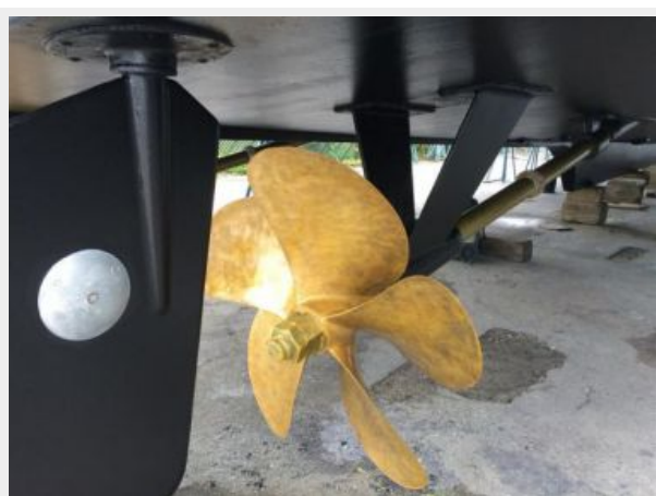
Oct 2014 Prop Speed