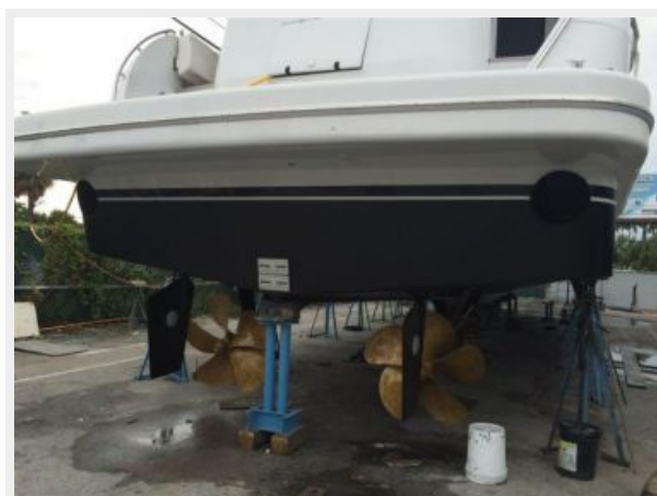
Oct 2014 Bottom Job