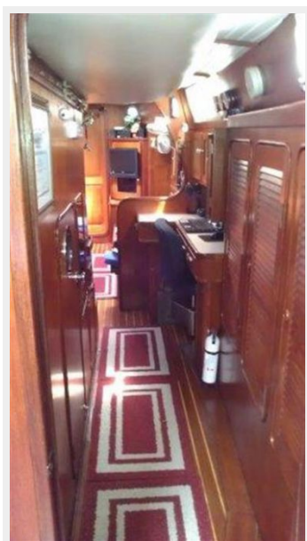
Walkthrough. Note storage to starboard.