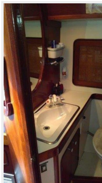
Aft Head, note sink