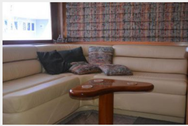
custom teak table