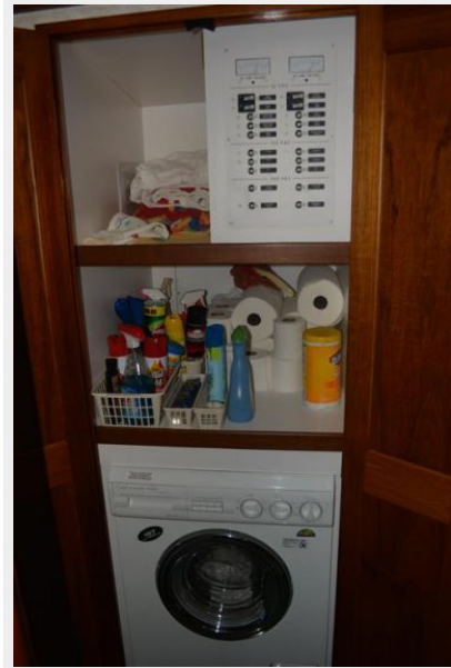
laundry and storage closet