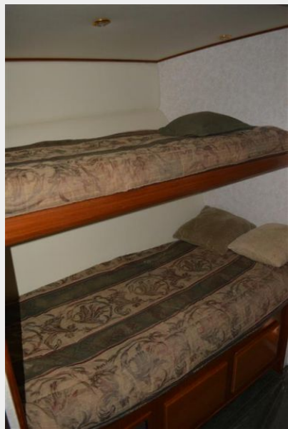
oversized bunks to port