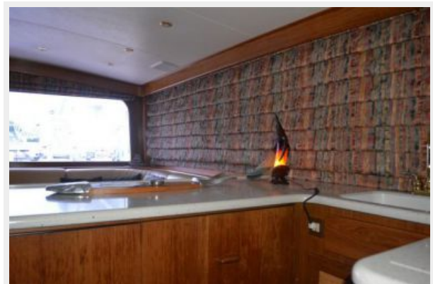
galley view to port and aft with window treatments