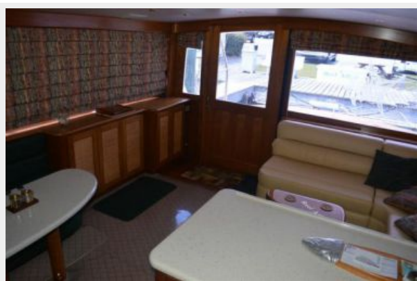
salon view aft and stbd