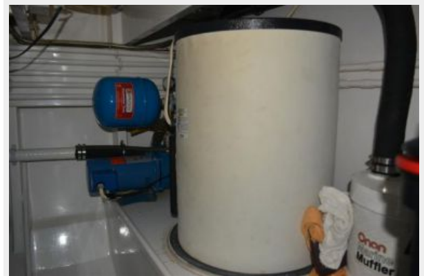
water heater on generator shelf