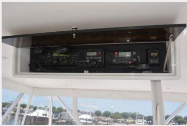
overhead electronics box