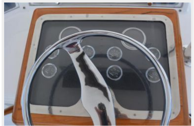
teak helm bubble with manual gauges and single lever controls