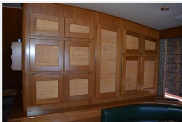
closed dash cabinets