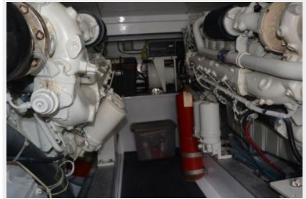
ER view 3