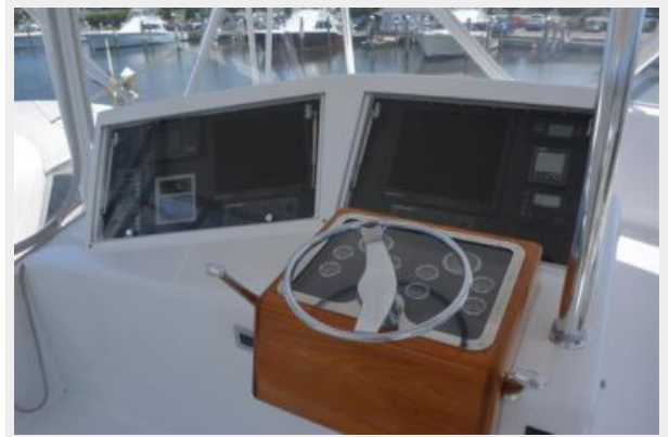
console and bubble uncovered