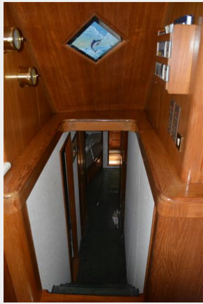
fwd view of steps and companionway