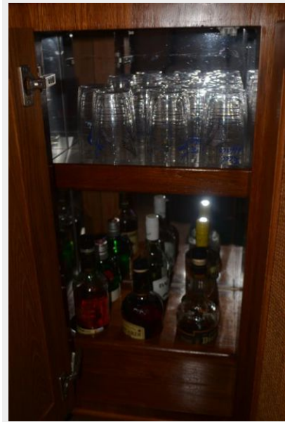
custom libations locker