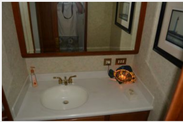
mb view 3