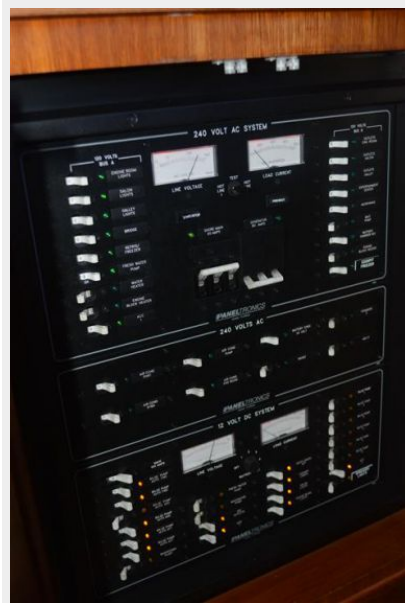
Paneltronics custom AC/DC electrical panel