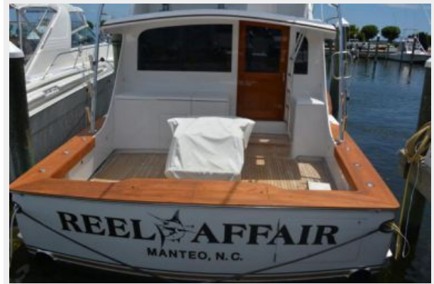
view of transom, cockpit layout and back bulkhead