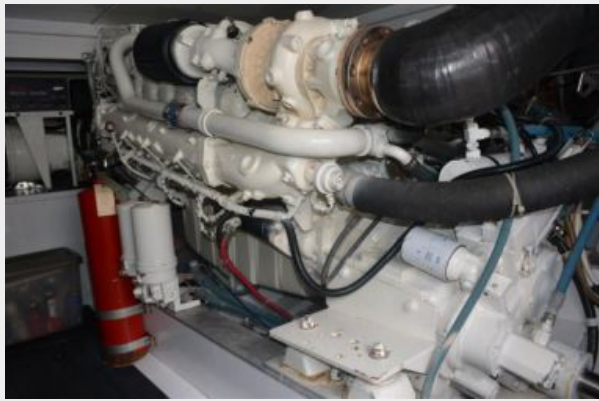
ER view 2