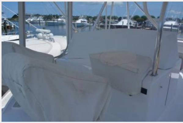
bridge console with teak bubble and electronics box covered