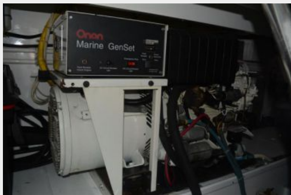
Onan 12kw generator