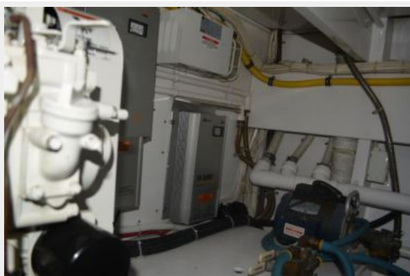
battery chargers and trunkline manifold