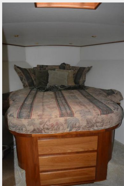
fwd stateroom queen size bed