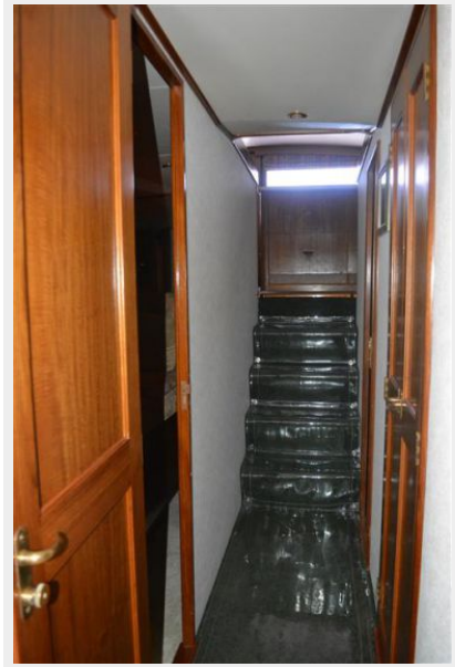
aft view of companionway and steps