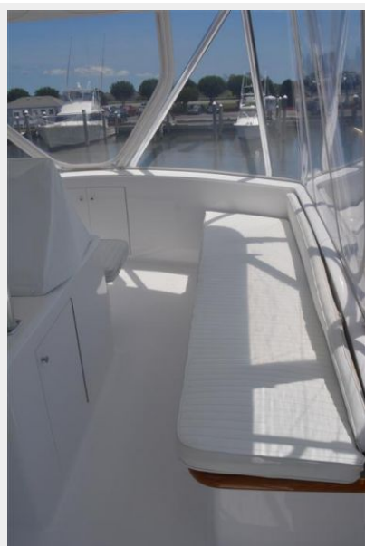
bridge seating stbd