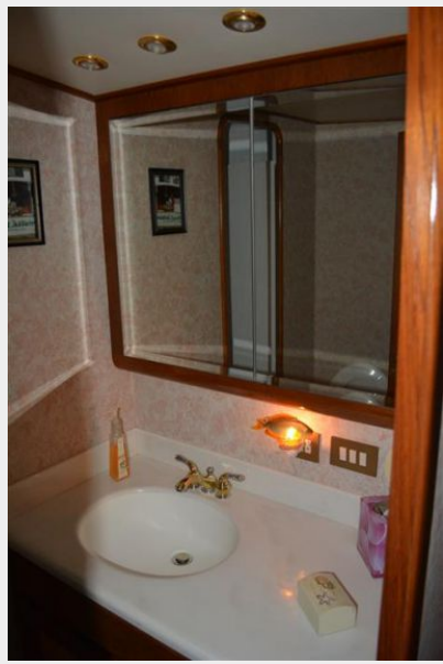
mb view 1