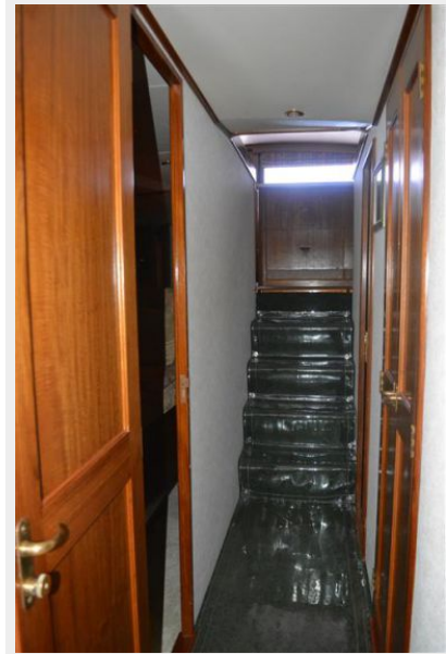
aft view of companionway and steps