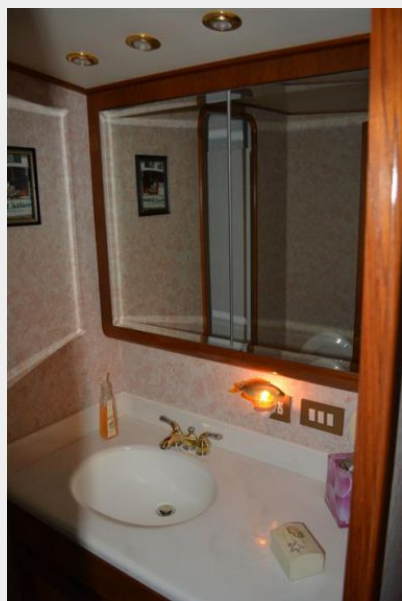
mb view 1