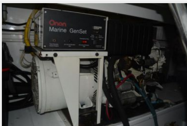
Onan 12kw generator