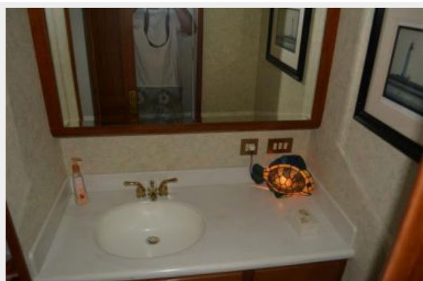
mb view 3