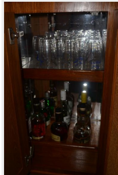
custom libations locker