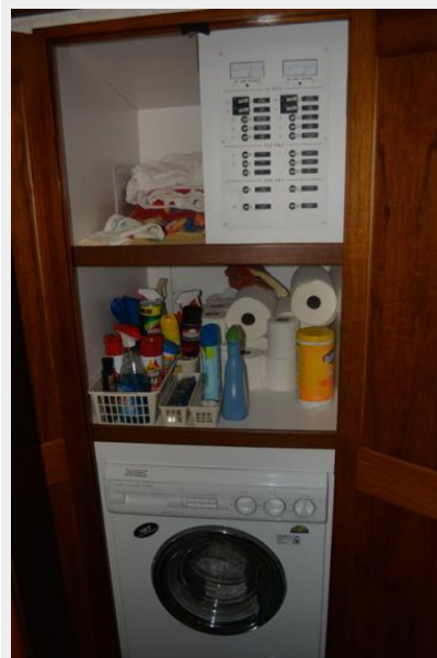
laundry and storage closet