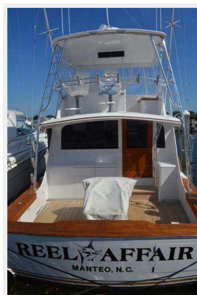
stern view from dock