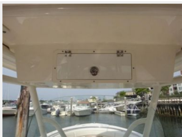
T-Top Storage Box