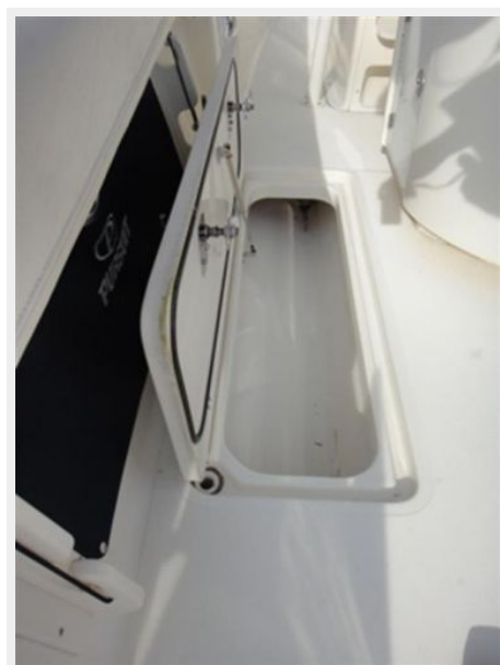
In Deck Fish Boxes