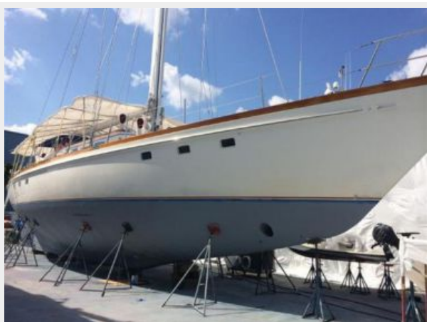
Yes - On land @ Ft. Lauderdale Marine Center