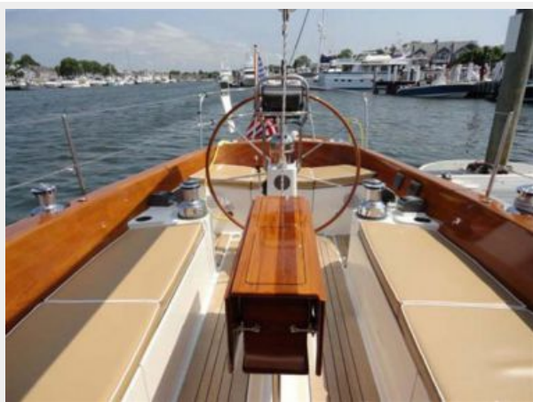
Cockpit Looking Aft