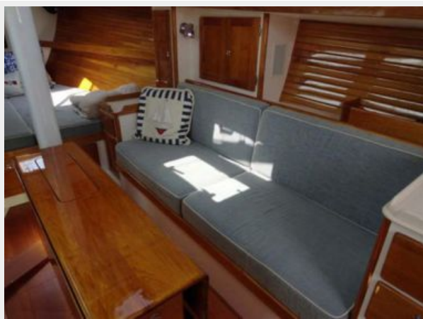
Main Salon Starboard Side