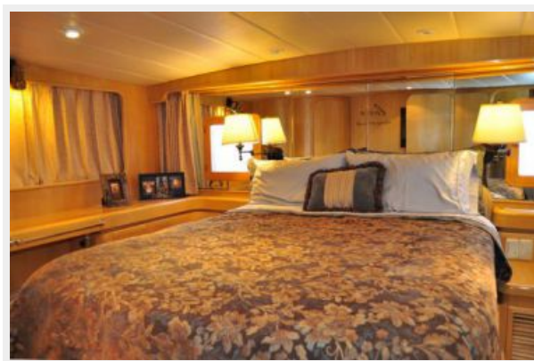
56' Johnson High Tech master stateroom