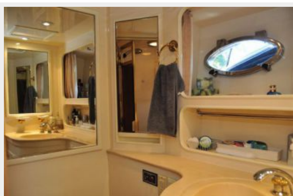
56' Johnson High Tech master stateroom head