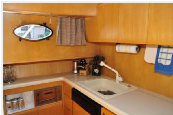
56' Johnson High Tech galley