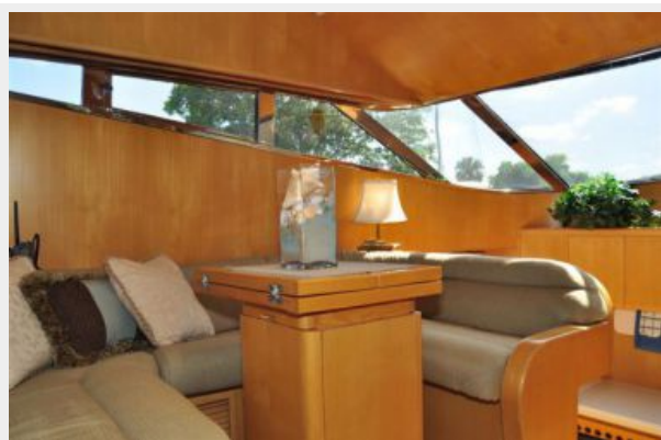
56' Johnson High Tech dinette