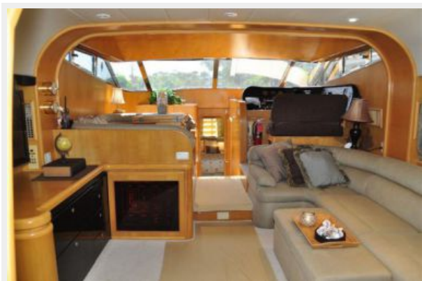
56' Johnson High Tech salon forward