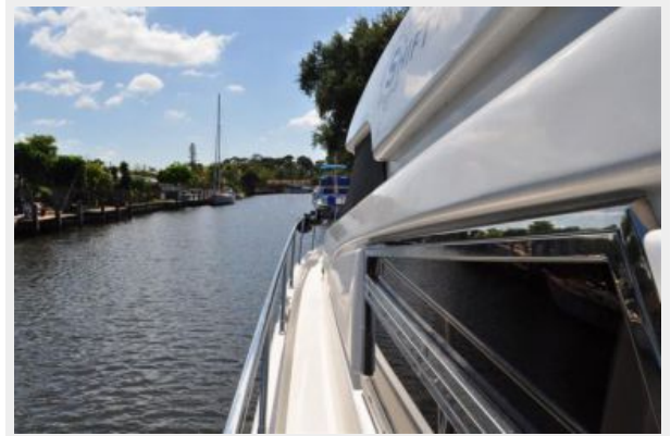
56' Johnson High Tech port side deck