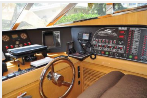
56' Johnson High Tech lower helm