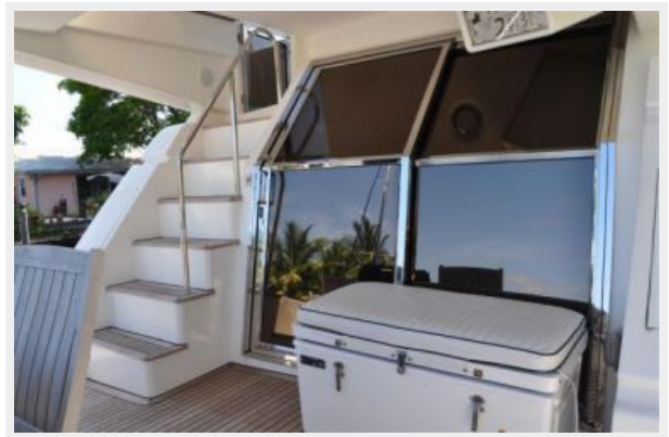
56' Johnson High Tech aftdeck