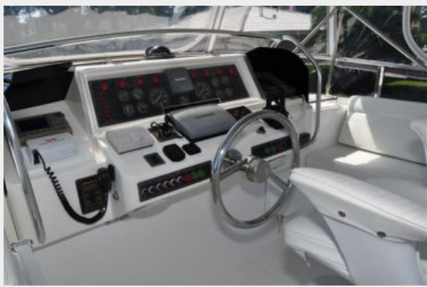
56' Johnson High Tech flybridge