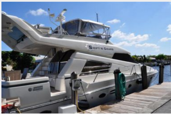
56' Johnson High Tech starboard aft profile