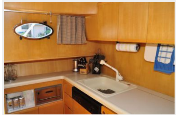
56' Johnson High Tech galley