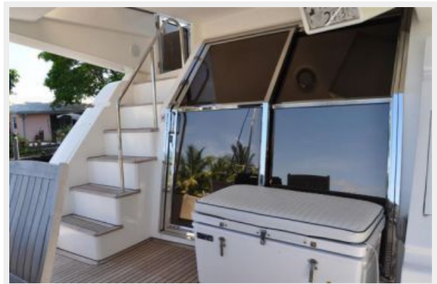
56' Johnson High Tech aftdeck