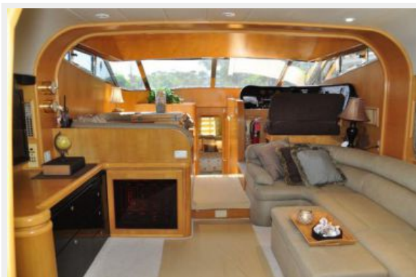
56' Johnson High Tech salon forward