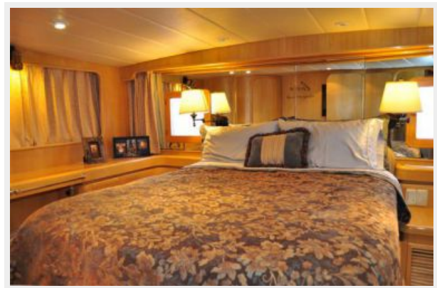
56' Johnson High Tech master stateroom