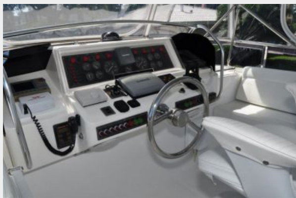
56' Johnson High Tech flybridge