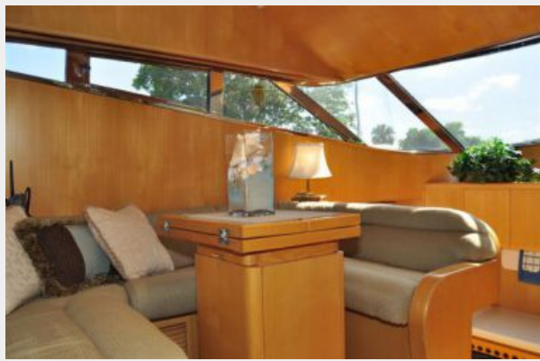
56' Johnson High Tech dinette