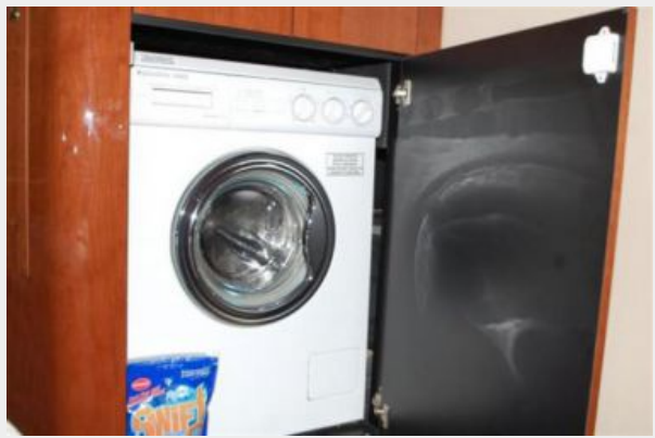
Washer & dryer - Located in master cabin