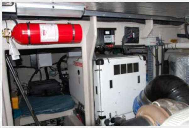
Westerbeke generator - Gen set in sound shield