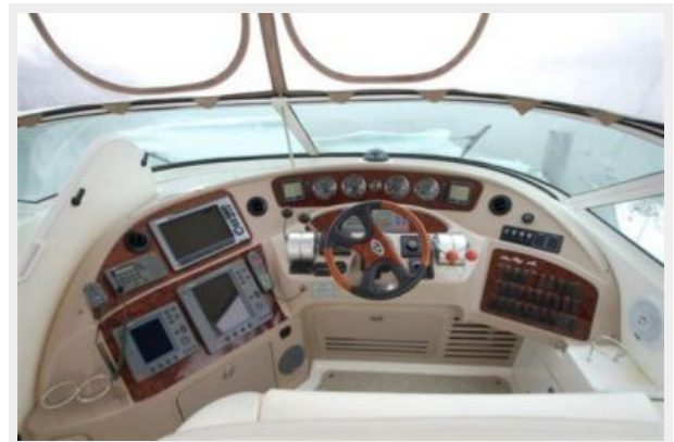
Helm Station & Navigation equipment - Double Seating