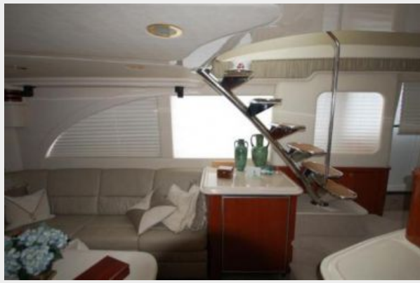
Stairs to flybridge - Port side of saloon