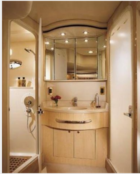
Manufacturer Provided Image - Master head, vanity, shower / Note OUR OPTION has Cherry Interior