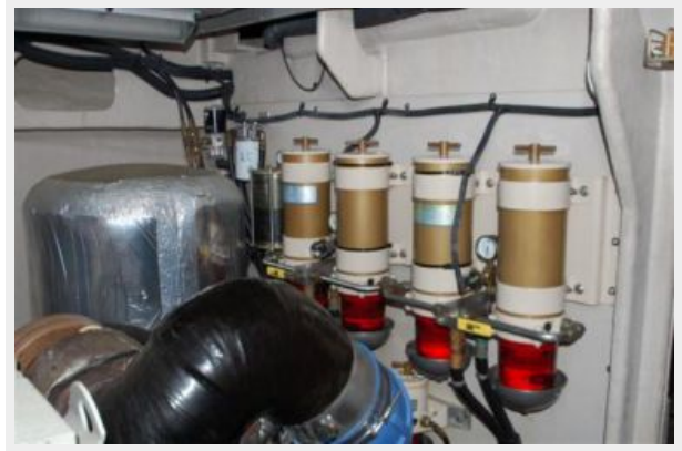
Manufacturer Provided Image - 540 CMY