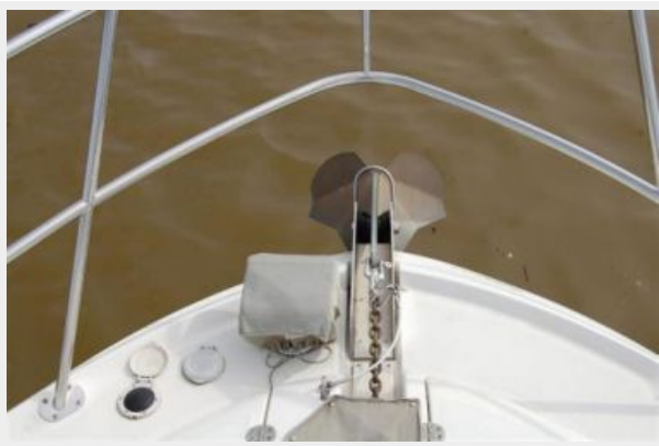
Bow / Anchoring System