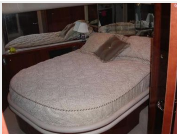
Master Stateroom - Walk-around Queen Bed with loads of storage space below