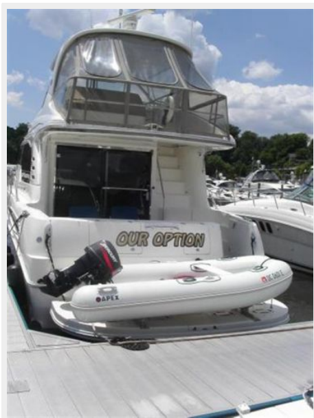
Dinghy & Outboard Motor on Lift.