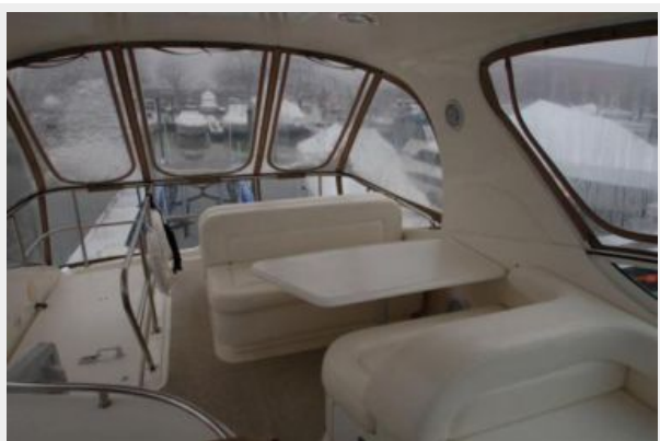
Flybridge seating & lounge area - Seats & lounges to port / Stairs to starboard