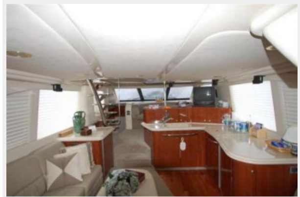
Galley & saloon - Looking forward, raised lounge is forward of galley