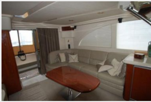
Saloon - L-shaped settee to port with hi-lo table, slider door to cockpit