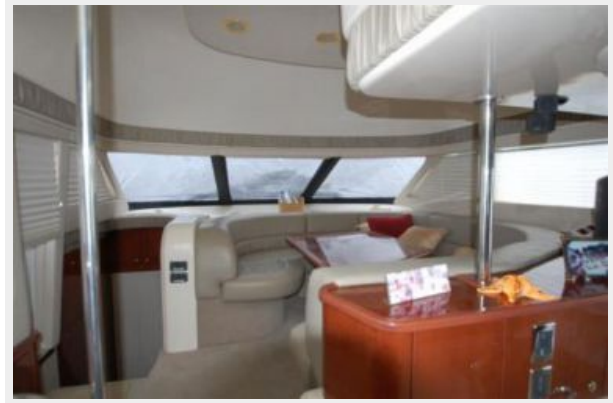
Dining / Lounge area - Raised area forward of the saloon & galley