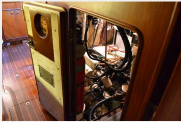
50' Gulfstar engine compartment access photo2