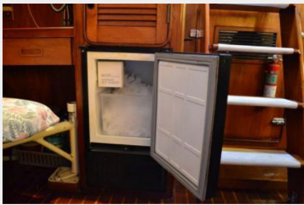
50' Gulfstar refrigeration photo1