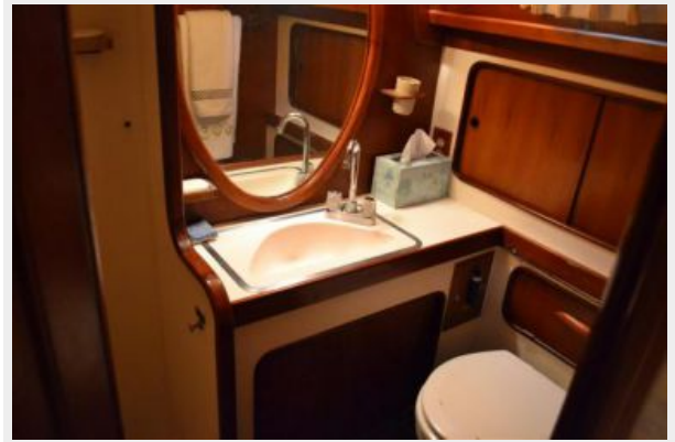
50' Gulfstar master stateroom head