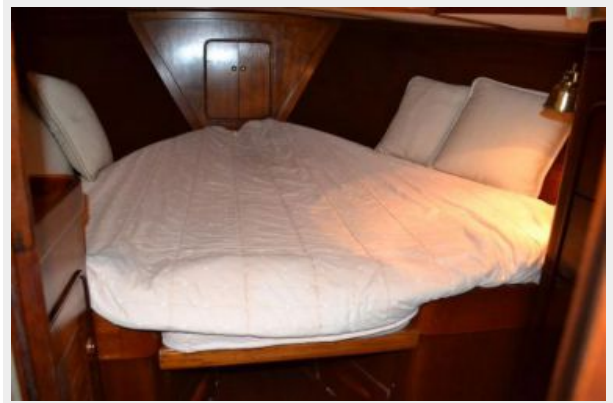
50' Gulfstar guest stateroom