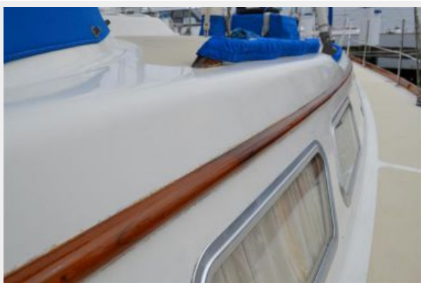
50' Gulfstar starboard side deck