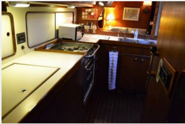
50' Gulfstar galley photo2