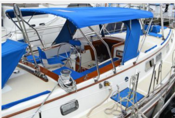
50' Gulfstar cockpit