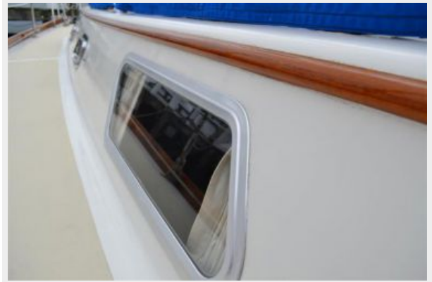
50' Gulfstar port side deck