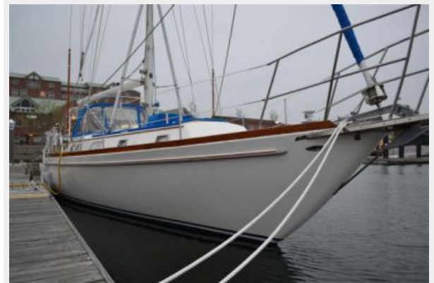
50' Gulfstar starboard forward profile