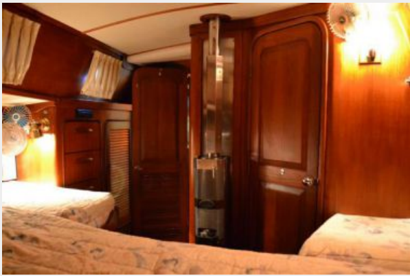
50' Gulfstar master stateroom photo2