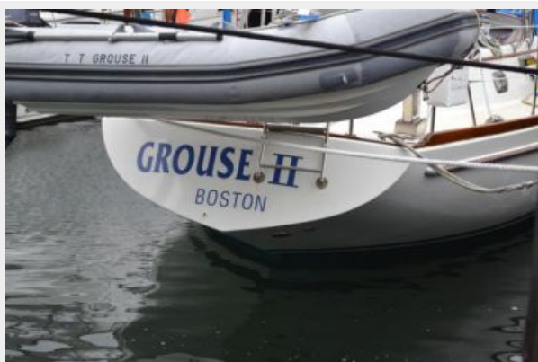
50' Gulfstar transom