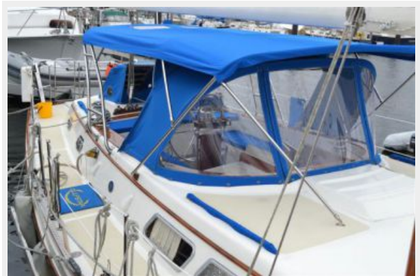
50' Gulfstar cockpit bimini-dodger