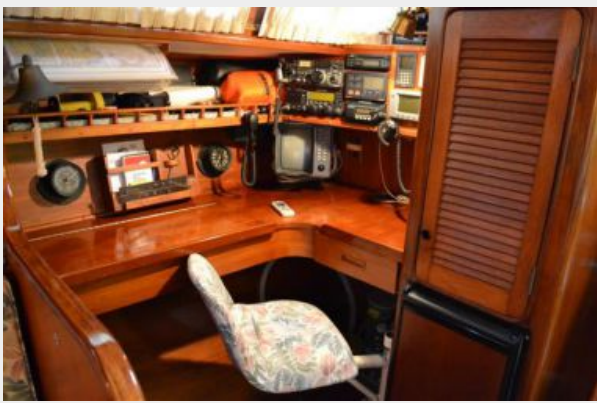
50' Gulfstar nav station photo1