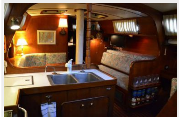
50' Gulfstar salon forward