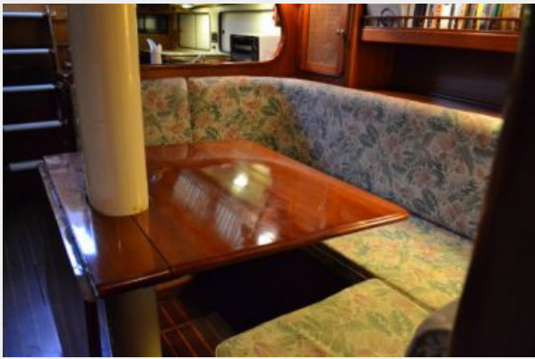
50' Gulfstar salon seating photo2