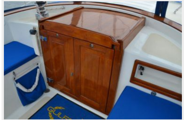
50' Gulfstar cockpit hatch