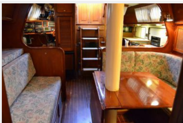
50' Gulfstar salon aft