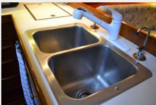
50' Gulfstar galley sink