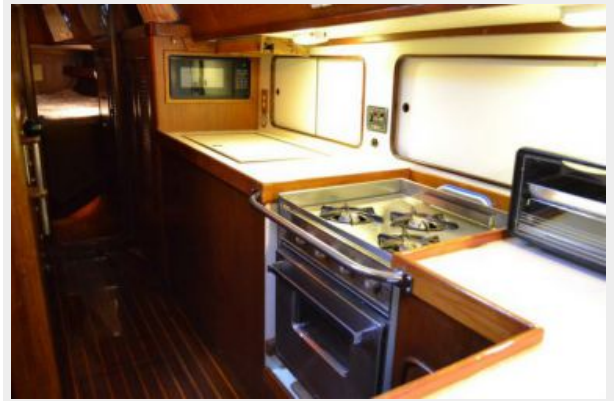
50' Gulfstar galley photo3