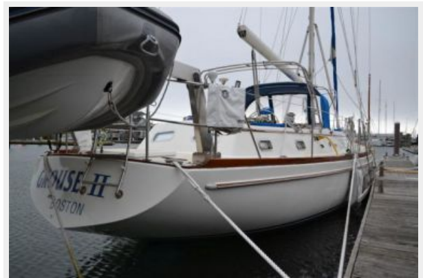
50' Gulfstar starboard aft profile