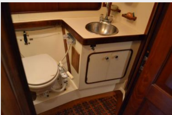
50' Gulfstar guest stateroom head