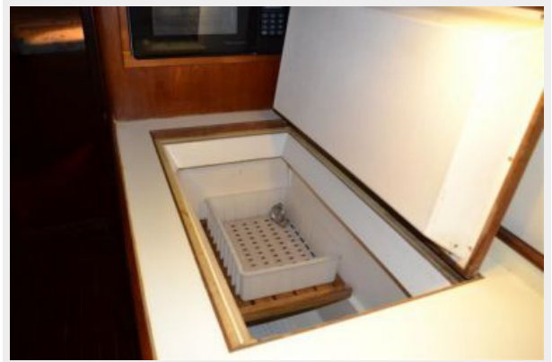
50' Gulfstar refrigeration photo2