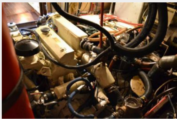
50' Gulfstar auxiliary photo2