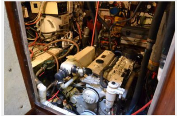
50' Gulfstar auxiliary photo1