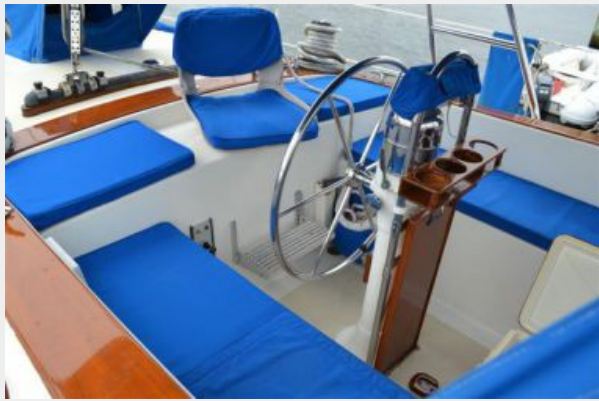
50' Gulfstar cockpit aft