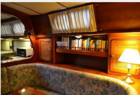
50' Gulfstar salon starboard