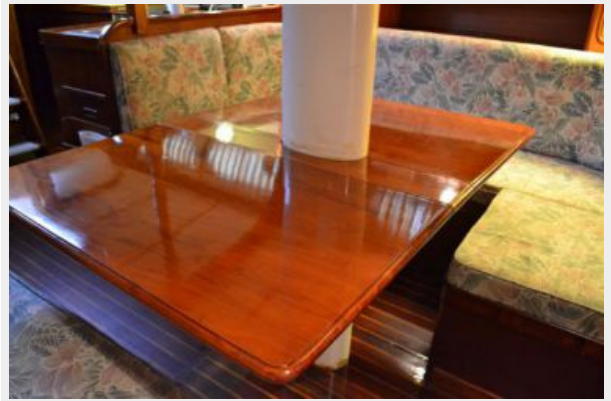
50' Gulfstar salon seating photo3