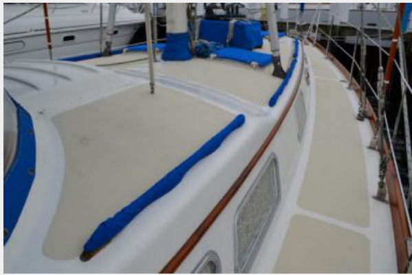
50' Gulfstar foredeck