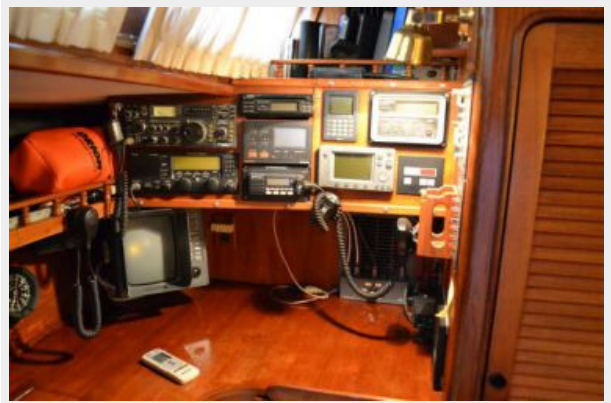
50' Gulfstar nav station photo2