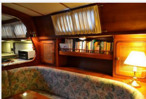
50' Gulfstar salon starboard