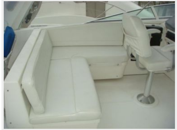
47' Bayliner flybridge port seating