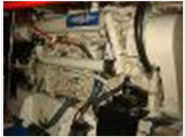
47' Bayliner port main engine