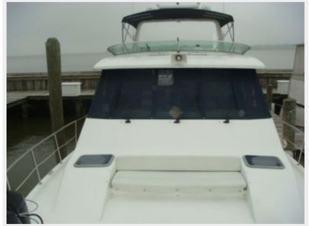
47' Bayliner foredeck aft