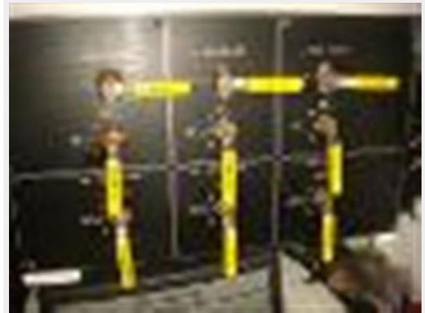
47' Bayliner fuel manifold