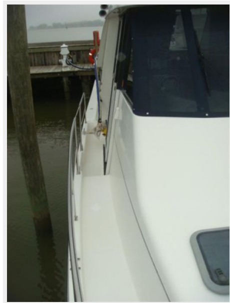
47' Bayliner starboard side deck