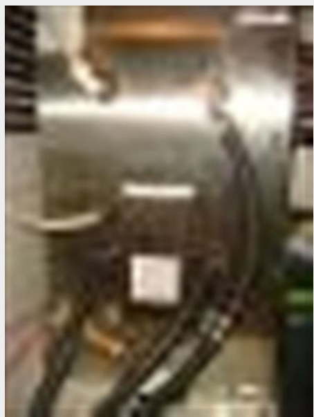
47' Bayliner water heater