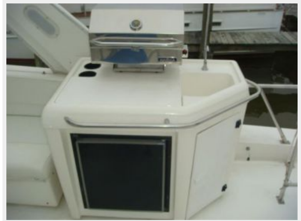
47' Bayliner flybridge wetbar