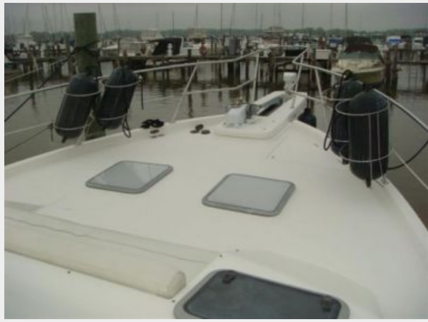
47' Bayliner foredeck