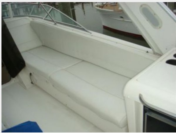
47' Bayliner flybridge starboard seating