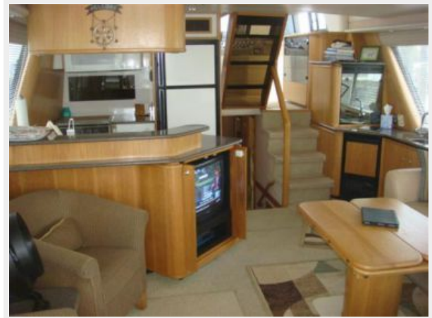
47' Bayliner salon forward