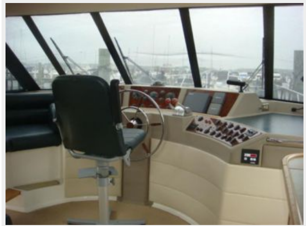
47' Bayliner pilothouse forward