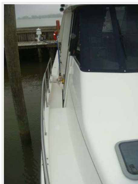
47' Bayliner starboard side deck