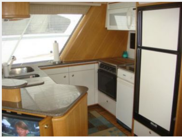
47' Bayliner galley