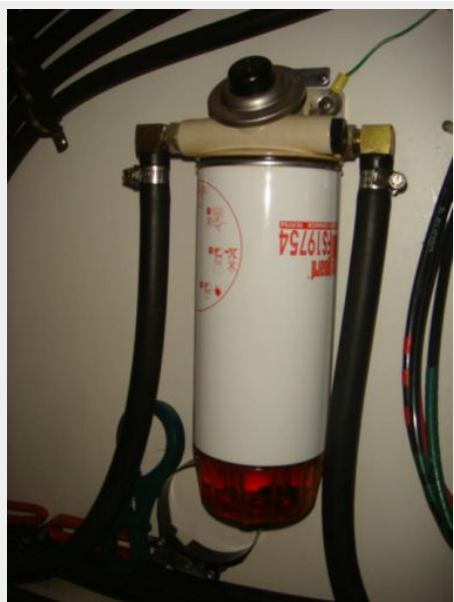
47' Bayliner port fuel filter