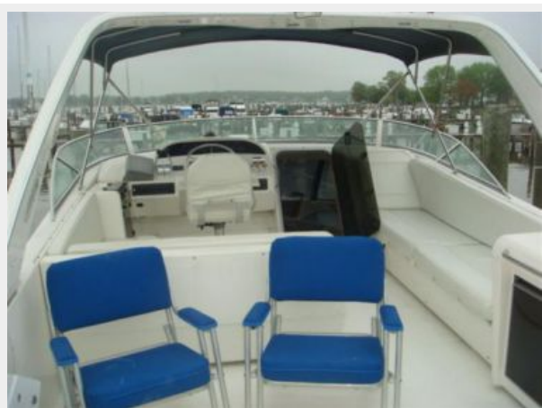
47' Bayliner flybridge forward