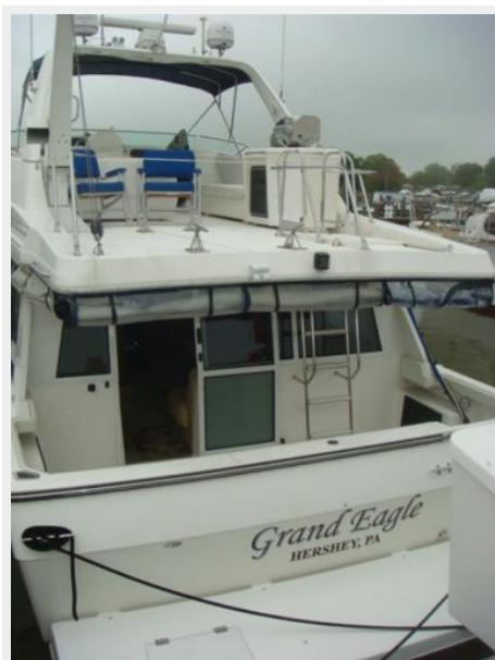
47' Bayliner aft profile