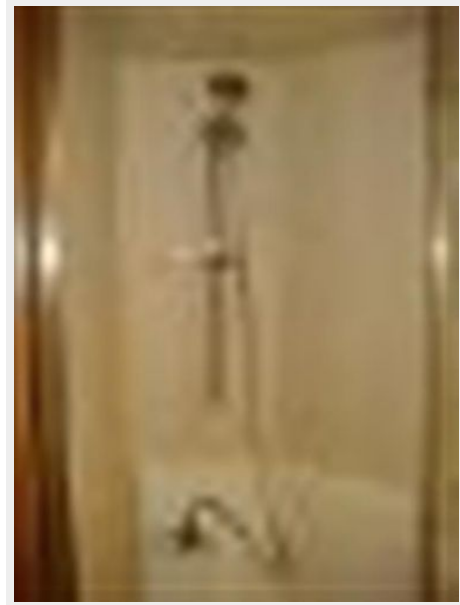
47' Bayliner guest stateroom shower