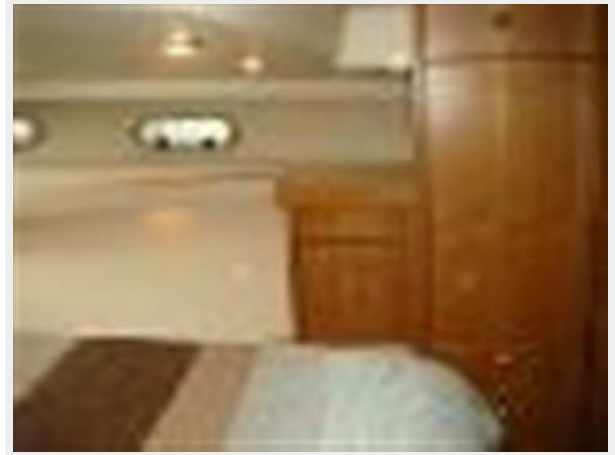
47' Bayliner master stateroom starboard