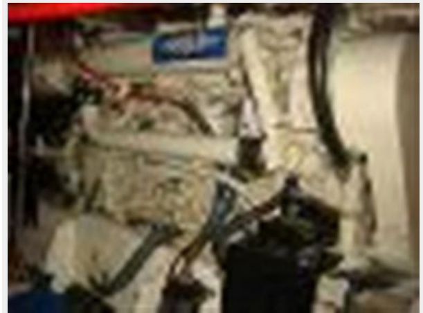
47' Bayliner port main engine