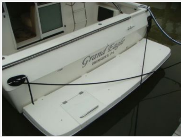
47' Bayliner swimplatform