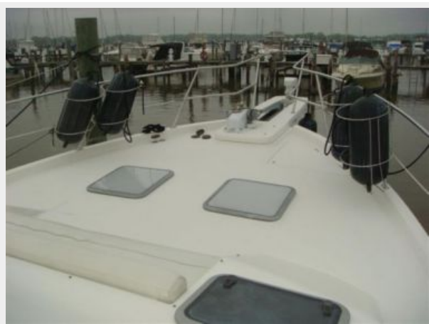
47' Bayliner foredeck