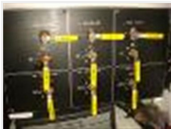
47' Bayliner fuel manifold