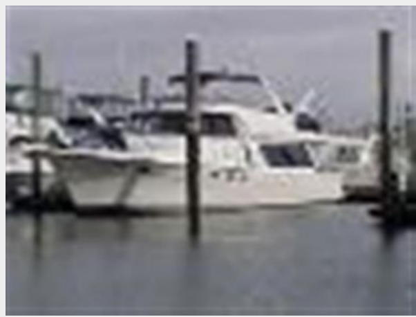
47' Bayliner port forward profile