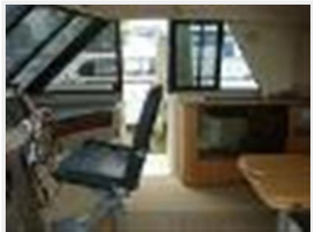
47' Bayliner pilothouse starboard