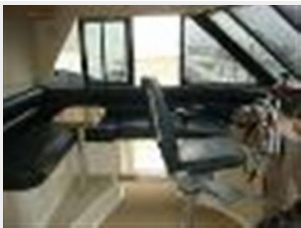
47' Bayliner pilothouse port