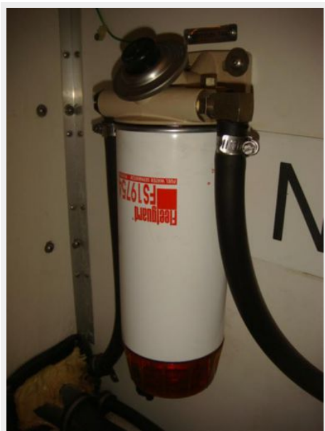
47' Bayliner starboard fuel filter