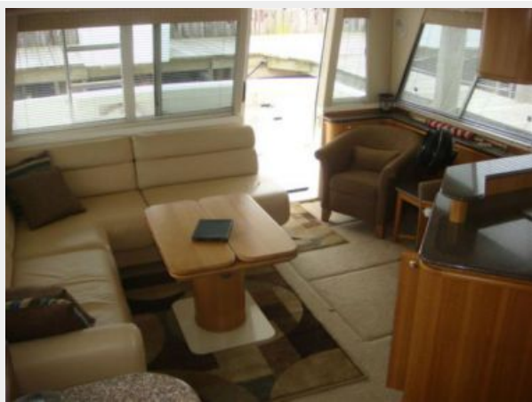
47' Bayliner salon aft