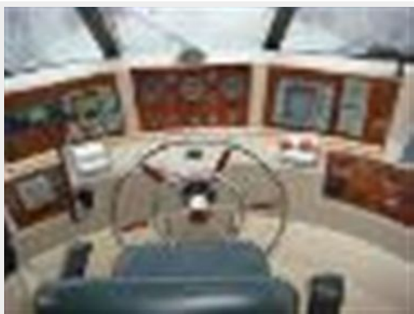
47' Bayliner pilothouse helm