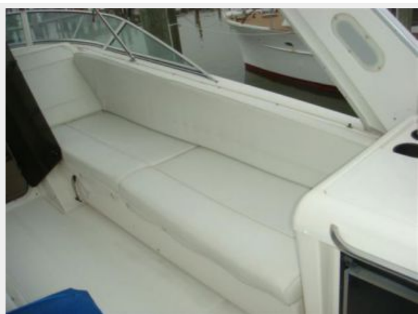
47' Bayliner flybridge starboard seating