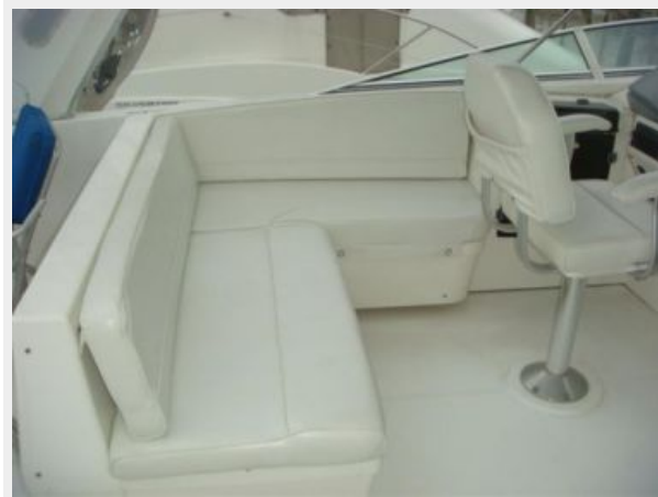
47' Bayliner flybridge port seating