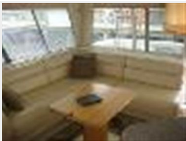
47' Bayliner salon starboard seating