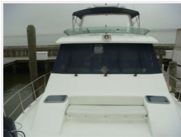
47' Bayliner foredeck aft