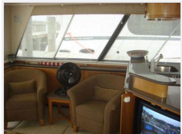
47' Bayliner salon port