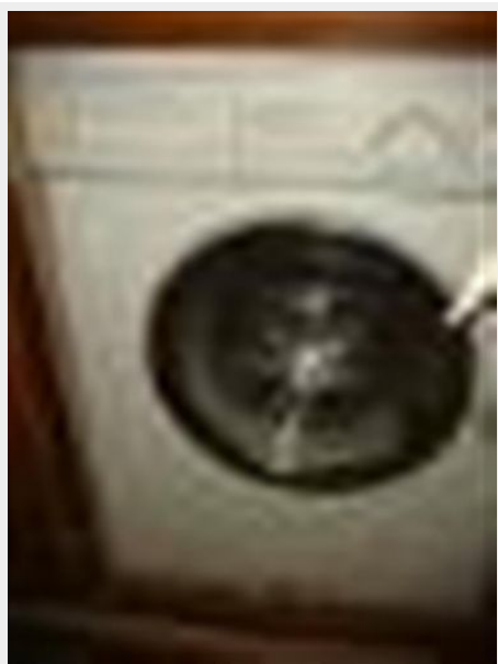
47' Bayliner washer-dryer