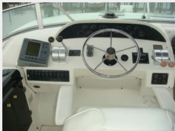
47' Bayliner flybridge helm