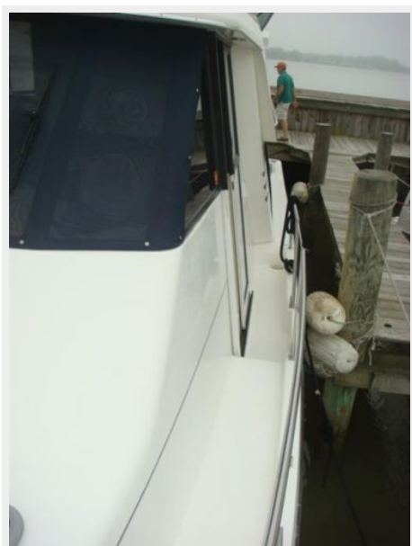
47' Bayliner port side deck