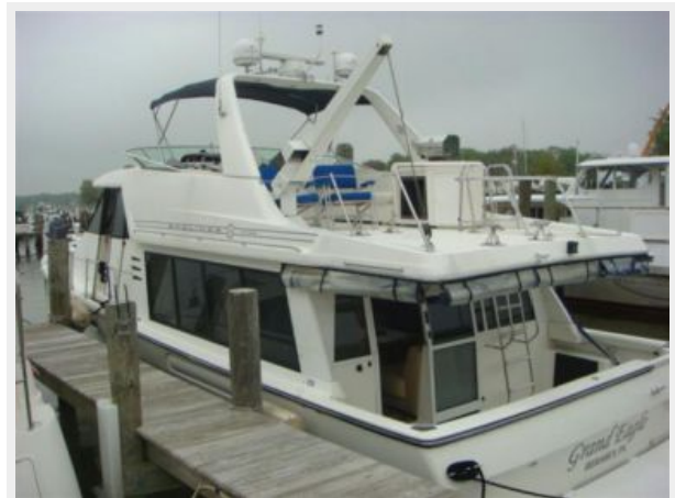
47' Bayliner port aft profile