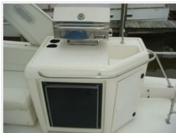
47' Bayliner flybridge wetbar