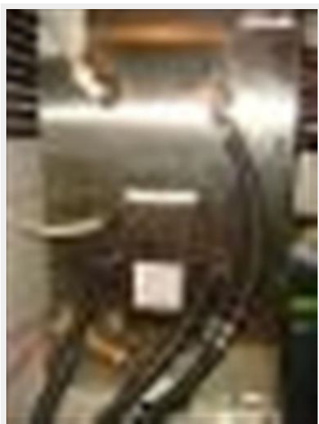
47' Bayliner water heater