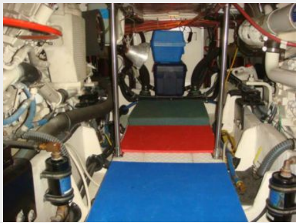
47' Bayliner engine room aft