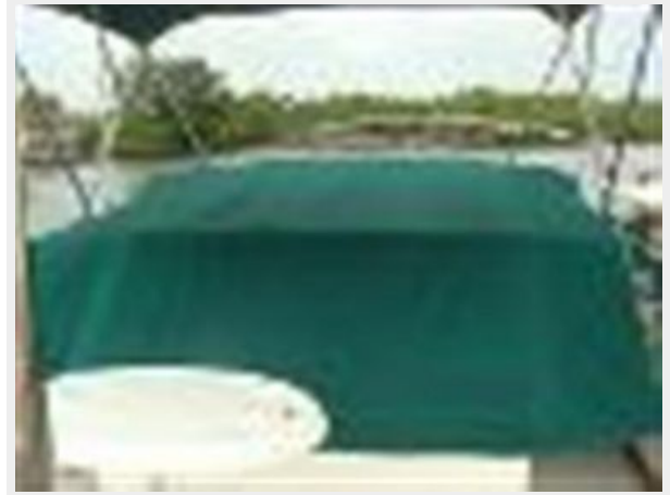
36' CT Trawler flybridge covered