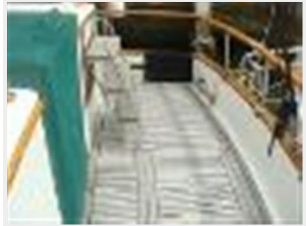
36' CT Trawler cockpit starboard