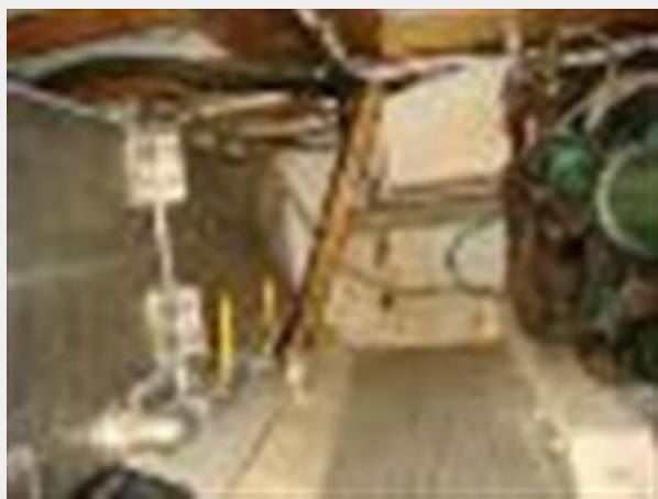
36' CT Trawler engine room starboard aft