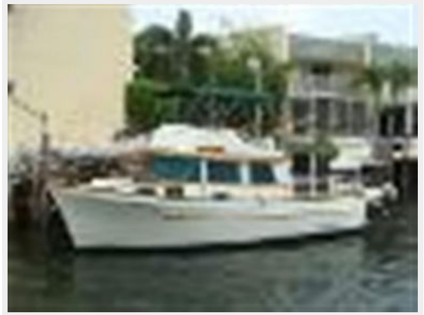
36' CT Trawler port forward profile