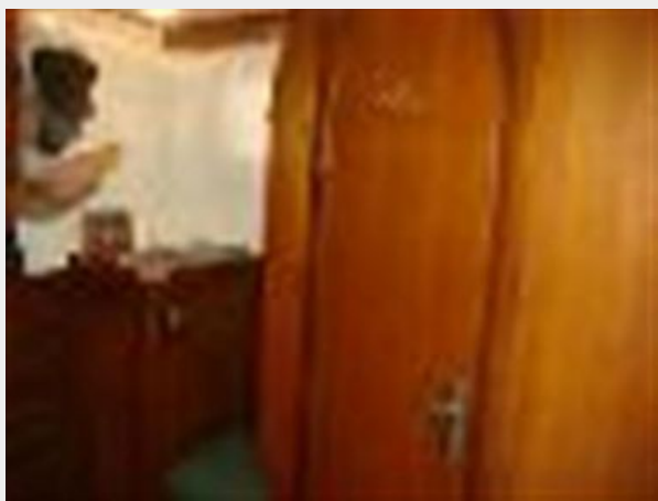
36' CT Trawler master stateroom port