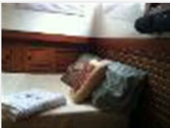
36' CT Trawler master stateroom starboard