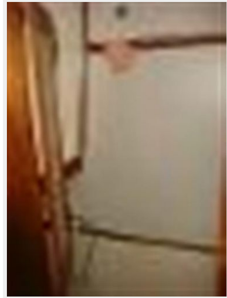
36' CT Trawler guest stateroom head