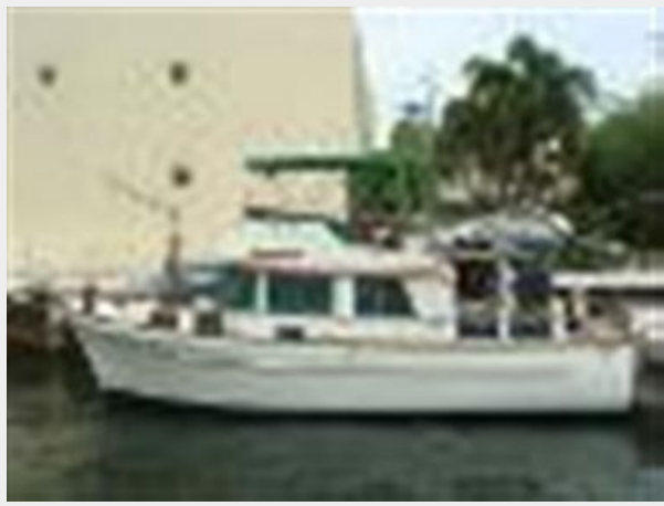
36' CT Trawler port profile