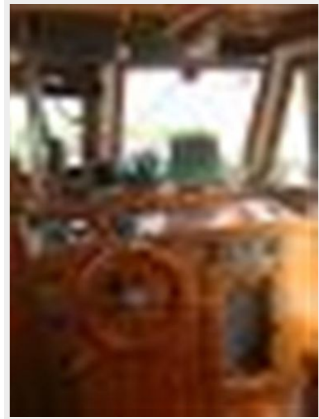
36' CT Trawler lower helm