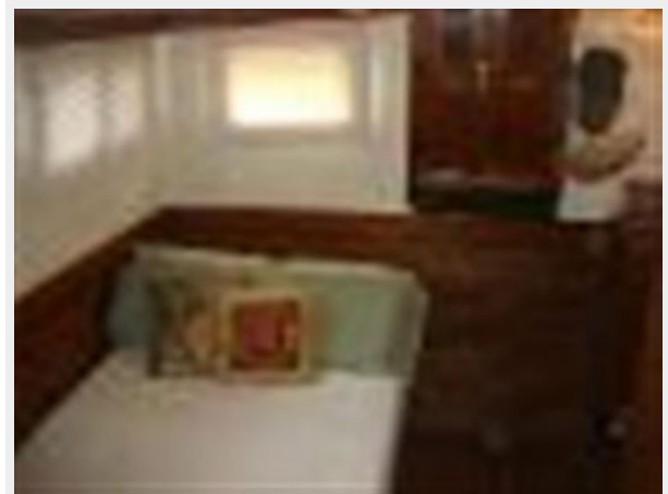
36' CT Trawler master stateroom