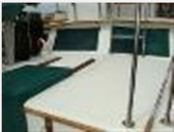
36' CT Trawler trunk cabin forward