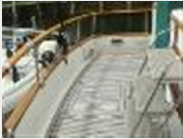
36' CT Trawler cockpit port