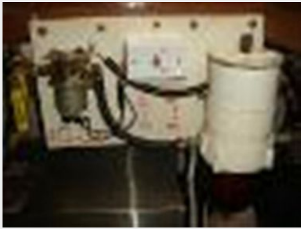
36' CT Trawler fuel polishing system