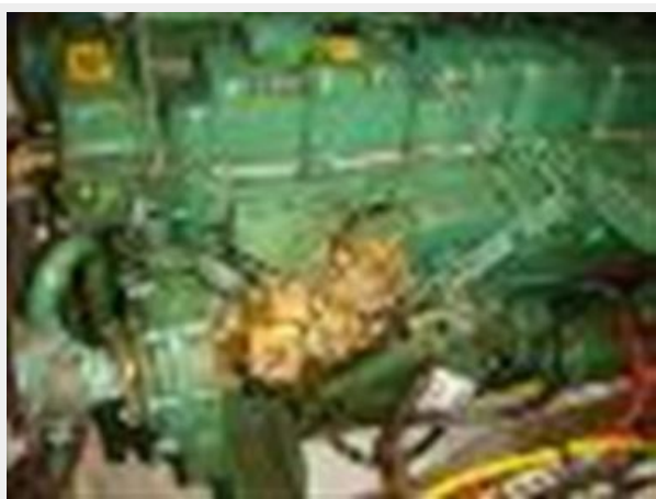
36' CT Trawler main engine photo2