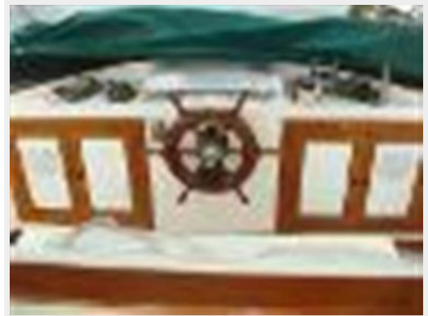
36' CT Trawler flybridge helm