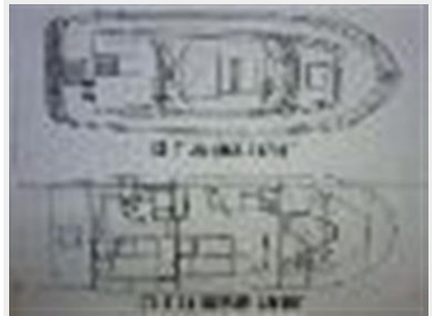
36' CT Trawler layout