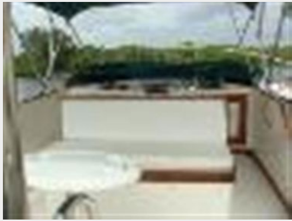
36' CT Trawler flybridge forward