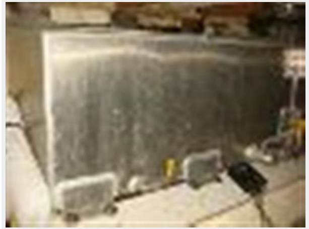
36' CT Trawler electrical panel