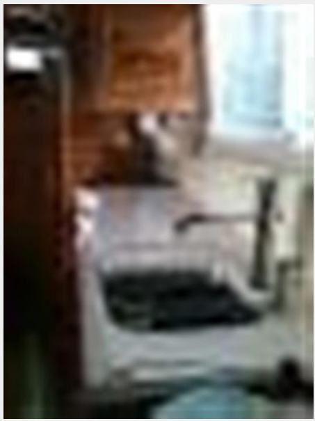
36' CT Trawler galley photo2