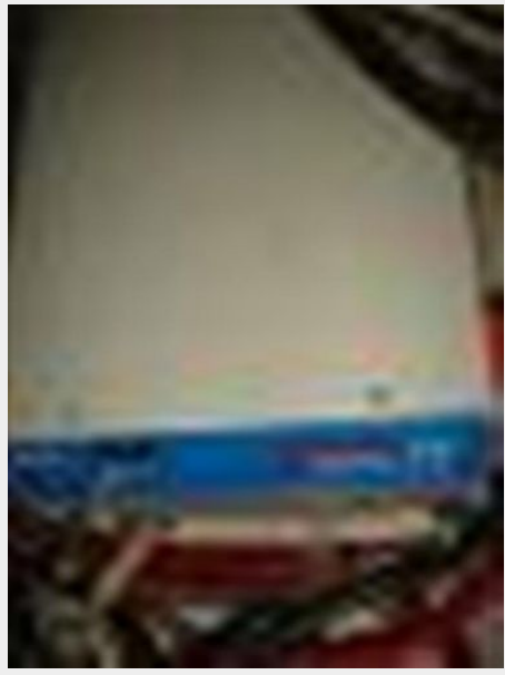
36' CT Trawler inverter