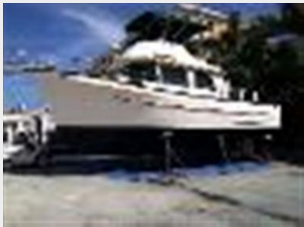
36' CT Trawler hauled out photo1