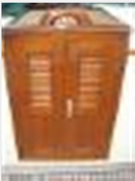
36' CT Trawler cockpit-master stateroom hatch