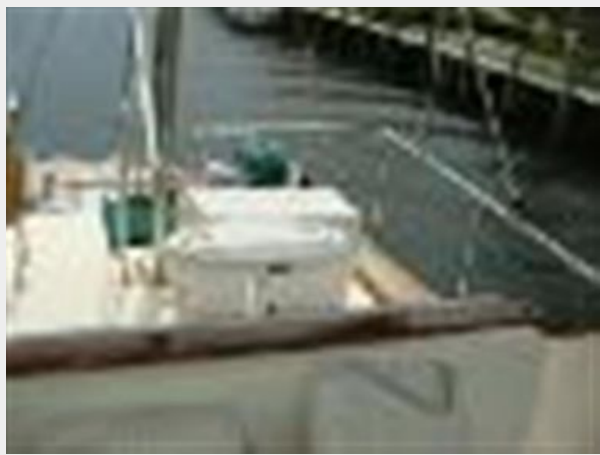
36' CT Trawler flybridge aft