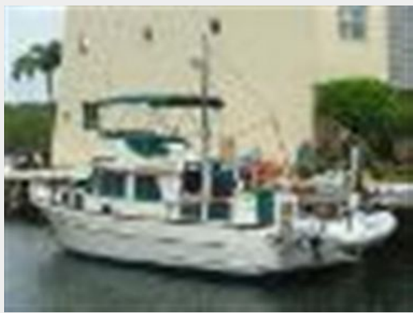
36' CT Trawler port aft profile