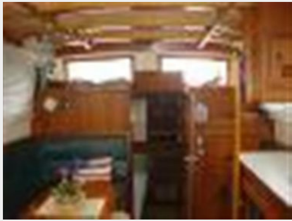
36' CT Trawler salon aft