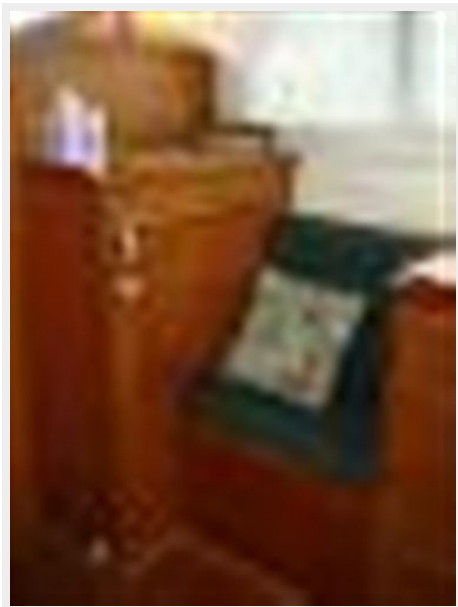
36' CT Trawler salon port aft