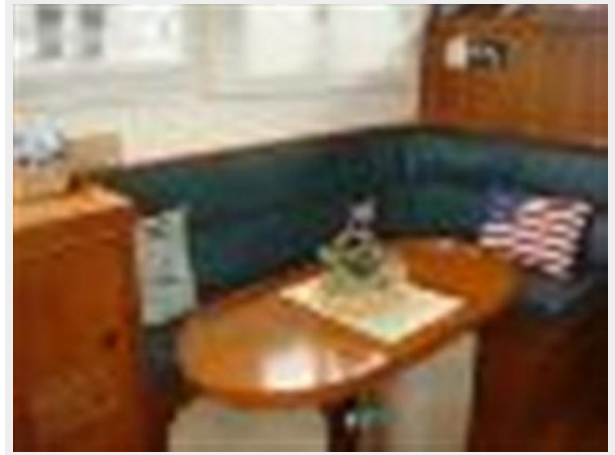
36' CT Trawler salon seating