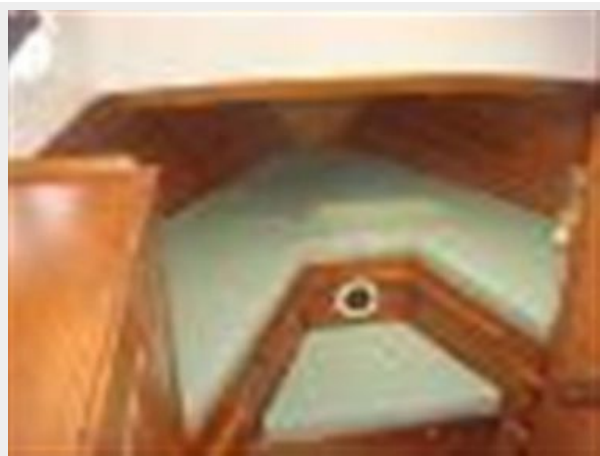
36' CT Trawler guest stateroom