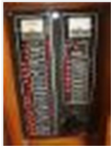
36' CT Trawler electrical panel