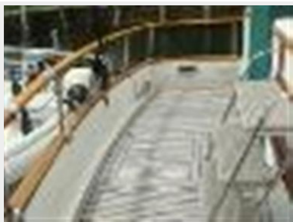
36' CT Trawler cockpit port