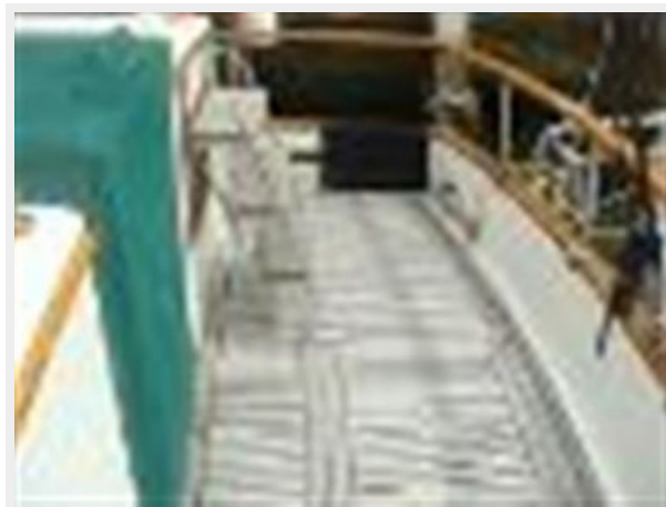
36' CT Trawler cockpit starboard