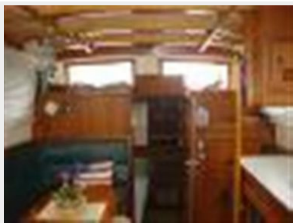
36' CT Trawler salon aft