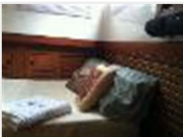
36' CT Trawler master stateroom starboard