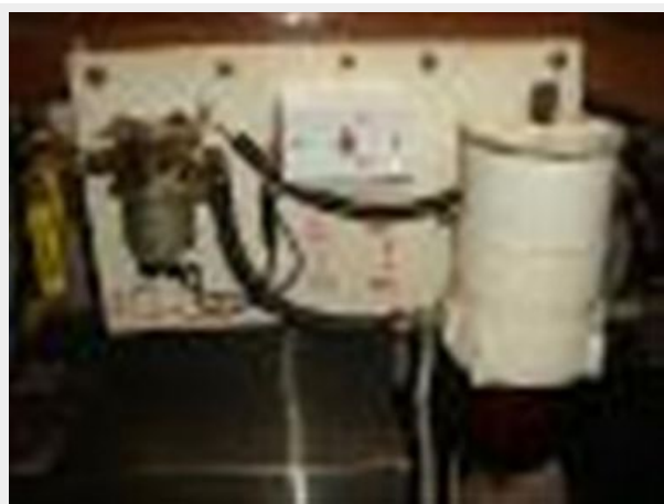
36' CT Trawler fuel polishing system