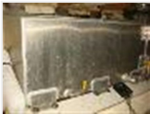
36' CT Trawler electrical panel