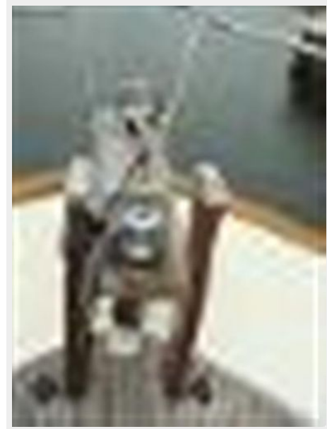
36' CT Trawler anchor windlass