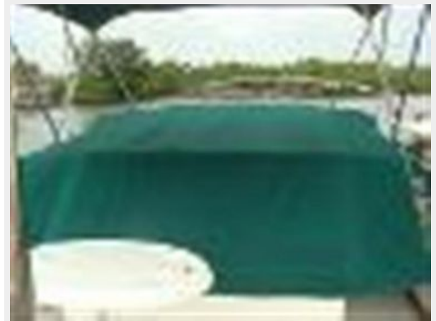
36' CT Trawler flybridge covered