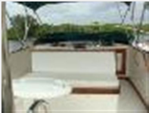
36' CT Trawler flybridge forward