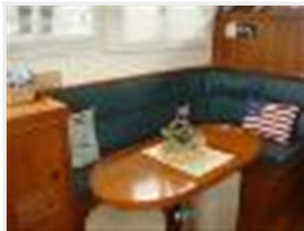
36' CT Trawler salon seating