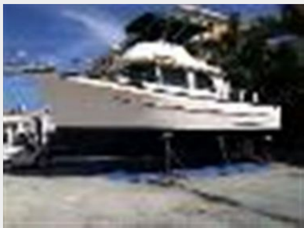
36' CT Trawler hauled out photo1