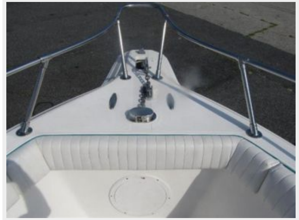
Bow Rail, Combing & Anchor