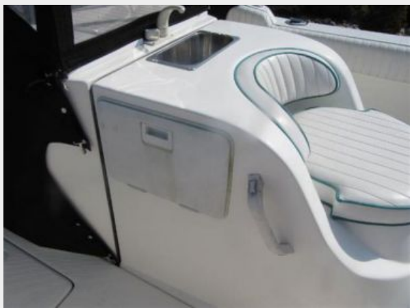
Aft Seat Tackle Center